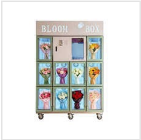
Flower Vending Machine