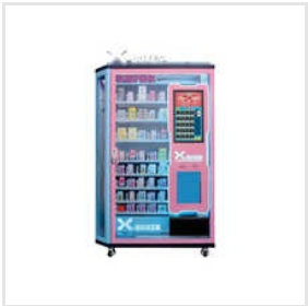
Electronic Product Vending Machine