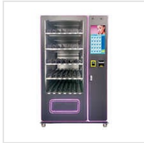
Product Vending Machine With Screen