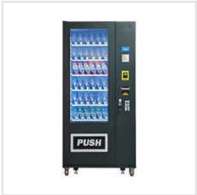
36 Channel Refrigerated Vending