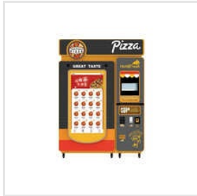
Pizza Vending Machine