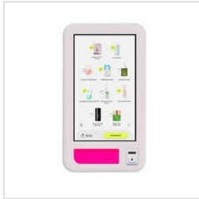
Wall-Mounted Vending Machine With