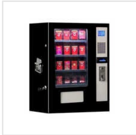
Makeup Product Vending Machine