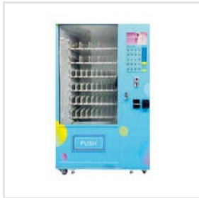
Snack Vending Machine With Screen