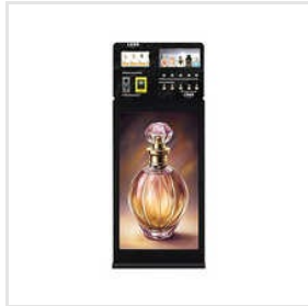
5 Nozzle Vending Machine With Large