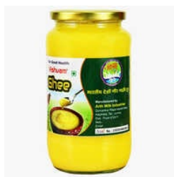
GEAR COW GHEE