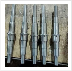
Motor Rotor Shaft