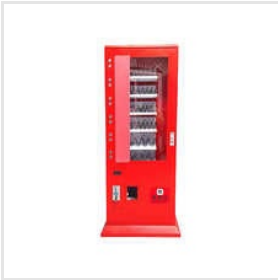
12 Button Vertical Stand-Alone Version