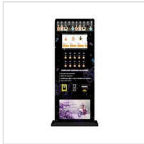
10 Button Vertical Perfume Spray