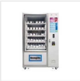
30 Cargo Lane Y-Axis Lift Vending Machine