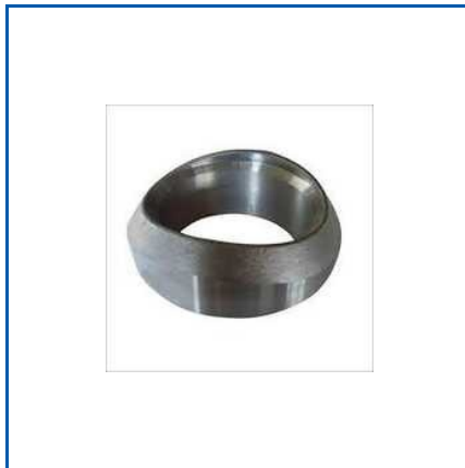
MILD STEEL NIPOLET