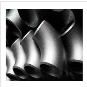
Mild Steel Pipe Fittings