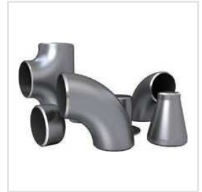
Butt Weld Pipe Fittings