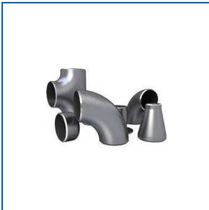
MS BUTT WELD PIPE FITTINGS

Butt Weld Pipe Fittings, Buttweld Tee, Carbon Steel Tee, Forged Couplings, GI Socket, MS Butt Weld Pipe Fittings, Mild Steel Flanges, Mild Steel Forged Fittings, Mild Steel Lateral Tee, Mild Steel Nipolet, Mild Steel Pipe Fittings, Steel Elbow Fittings, Sw Elbow, Threaded Tee, etc.