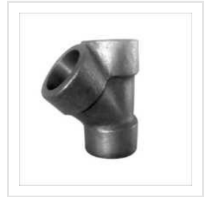
Mild Steel Lateral Tee