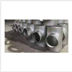
Carbon Steel Tee