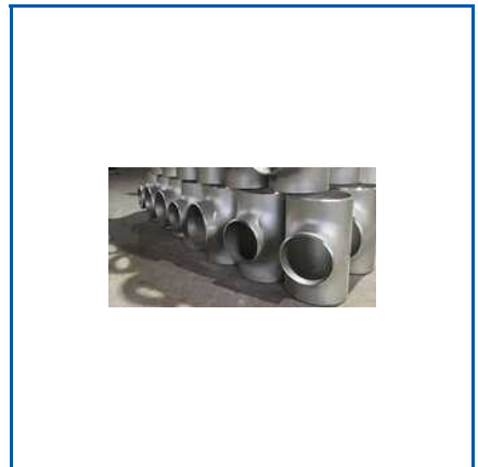
CARBON STEEL TEE