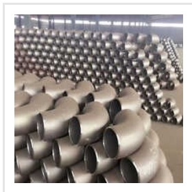
Steel Elbow Fittings