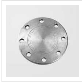
Mild Steel Flanges