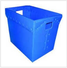
Polypropylene Corrugated Box