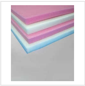
Epe Foam Sheet