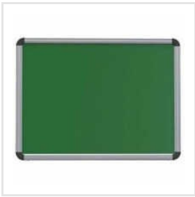
Aluminium School Notice Board