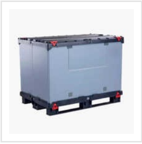
FLC Foldable Plastic Pallet Containers