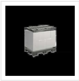
FLC Foldable Plastic Pallet Box Container