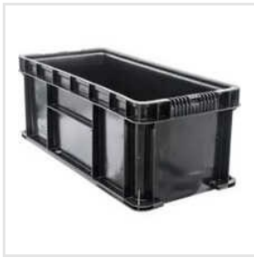
Blue Plastic Storage Bin