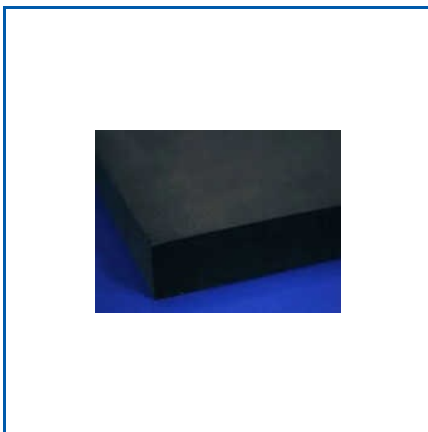
PU FOAM SHEET HIGH DENSITY

Air Bubble Wrap, Aluminium School Notice Board, Blue Folding Polypropylene Box, Blue Plastic Storage Bin, Blue Polypropylene Corrugated Box, Ci Pu Caster Wheel, Customized Wooden Pallet, EPE Foam Fitment, EPE Foam Profile, EPE Foam Rods, EPE Foam Roll, EPE Foam Sheet, Epe Foam Sheet, Export Wooden Packaging Boxes, FLC Foldable Plastic Pallet Box Container, etc.