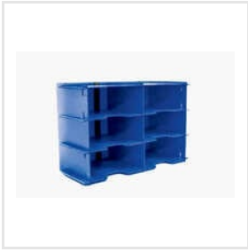
High Quality Polypropylene