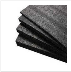
EPE Foam Sheet