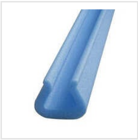
EPE Foam Profile