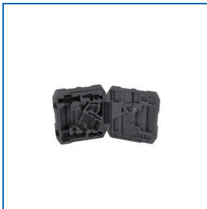
XLPE FOAM FITMENT