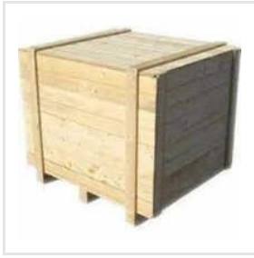
Wooden Export Pallet