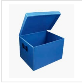
Blue Folding Polypropylene Box