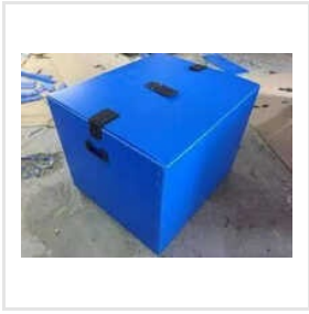
Polypropylene Pp Corrugated Box