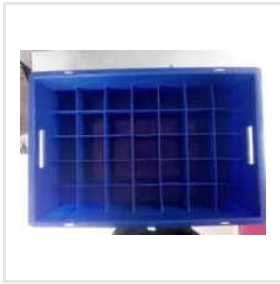
Partition Plastic Crate