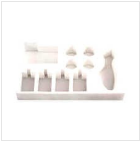
EPE Foam Fitment