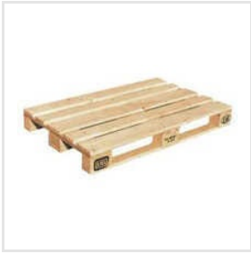
Customized Wooden Pallet