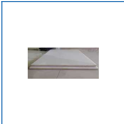
HIGH QUALITY CAST NYLON NATURAL SHEET

Black Cast Nylon Rod, High Quality Cast Nylon Natural Sheet, High Quality Cast Nylon Tube, High Quality PEEK Natural Rod, High Quality POM Natural Rod, High Quality POM Natural Sheet, High Quality UHMWPE Black Sheet, High Quality UHMWPE Black Rod, High Quality UHMWPE Green Sheet, Industrial PEEK Natural Rod, White Cast Nylon Rod, etc.