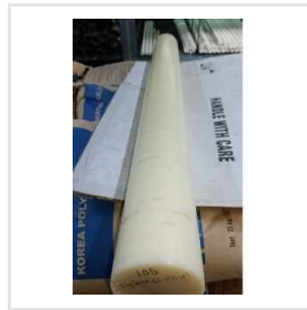
White Cast Nylon Rod