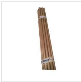
High Quality PEEK Natural Rod