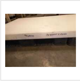
High Quality POM Natural Sheet