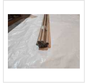
Industrial PEEK Natural Rod