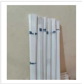
High Quality POM Natural Rod