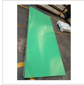
High Quality UHMWPE Green Sheet