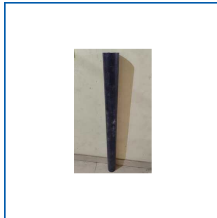
BLACK CAST NYLON ROD