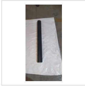
High Quality UHMWPE Black Rod