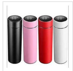
Temperature Water Bottle