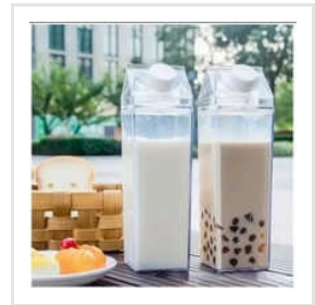
500ml Pharma Plastic Bottle