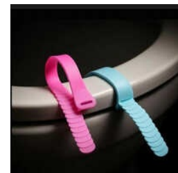
TOILET SEAT LIFTING BAND