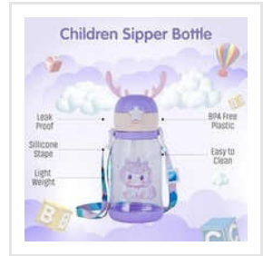
500ml Cartoon Sipper Bottle