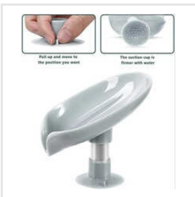
Leaf Plastic Soap Holder