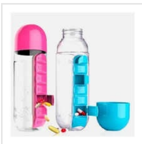
400ml Pills Box Plastic Insulated Water Bottle