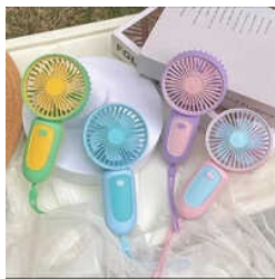
5 INCH PLASTIC MINI PORTABLE FAN

10 Pcs Leaf Shape Plant Fixing Clip, 10 Pcs Multicolor Round Hook, 1000ml Home Joy Stainless Steel Water Bottle, 1000ml Motivational Water Bottle, 100ml Glass Oil Spray, 1200ml Vacuum Flask, 2 Way Tiffin And Storage, 2000ml Motivational Water Bottle, 26L SS Frame Wardrobe Basket, 2m Baby Safety Protector Foam, 3 Pcs Toothbrush Cover, 3 Piece Kitchen Knife Set, 300ml USB Juicer, 3D Print Cute Pet Lunch Bag, 3pcs Toothbrush Cover, etc.