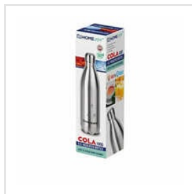
1000ml Home Joy Stainless Steel Water