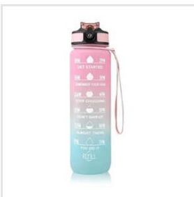
1000ml Motivational Water Bottle