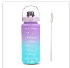
2000ml Motivational Water Bottle