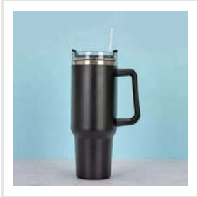
1200ml Vacuum Flask