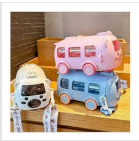
400ml Bus Plastic Bottle