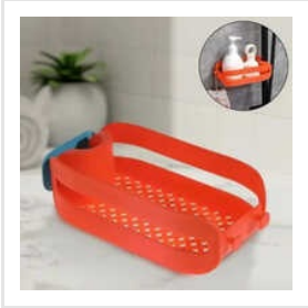
Rectangle Plastic Soap Holder