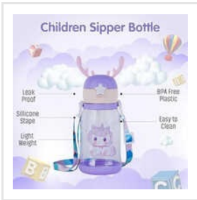
500ml Cartoon Sipper Bottle