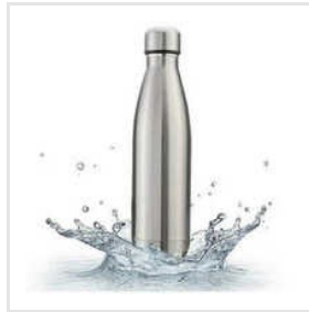
Stainless Steel Vacuum Flask