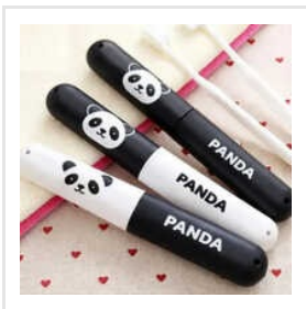
3pcs Toothbrush Cover