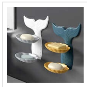
Mermaid Plastic Soap Holder