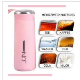
400ml Nice Glass Water Bottle