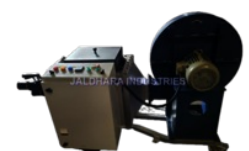
Electric Circulating Hot Air Duct Heater With