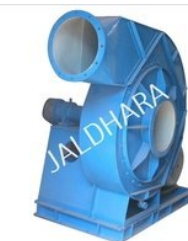
High Pressure Air Blower