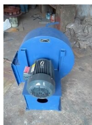
Industrial BLOWER FAN