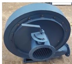
M S Blower