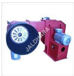
Pressure Jet Burner