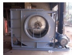
Double Inlet Double Width Blower