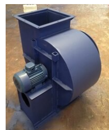
Industrial FAN BLOWER