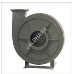
Material Conveying Blower