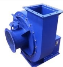
Industrial Air Blower