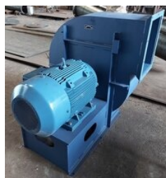
Industrial Air Blower Fan