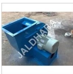
Industrial Volume Blower