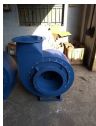
Industrial BLOWER PUMP