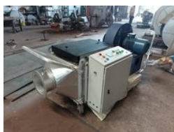
Hot Air Blower