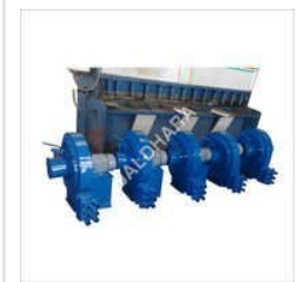
Multistage Centrifugal Blowers