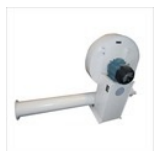
Trim Venturi Blower