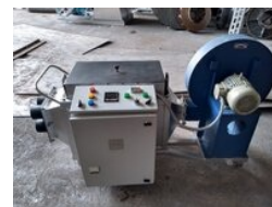
MS HOT AIR BLOWER INDUSTRIAL USES