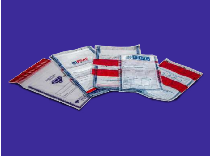
GOLD LOAN BAGS

We offer mailers with a wide array of punches; from rounded corners to cross-cut corners. We can make customized pieces as per client's requirements.