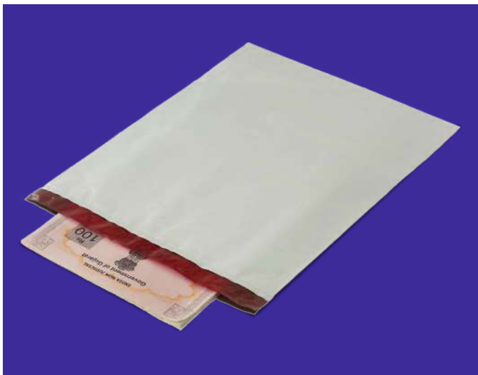
CONFIDENTIAL DOCUMENT BAG