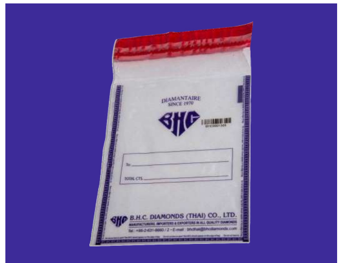
DIAMOND LOGISTICS BAG