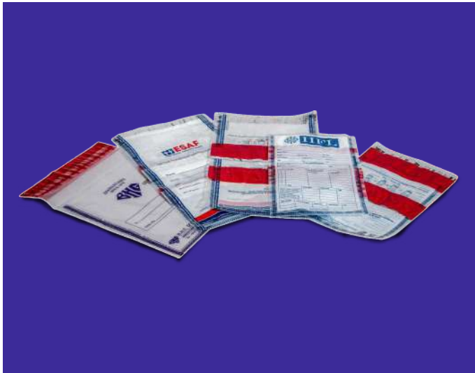
GOLD LOAN BAGS

Made from Co-Extruded polythene Films which is black within and white outside or it may be clear, it comes with a hot softened adhesive strip for straightforward & permanent closure.