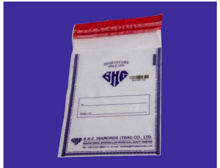
DIAMOND LOGISTICS BAG