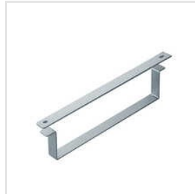
Cable Tray Cover Clamp