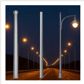
GI Street Light Poles