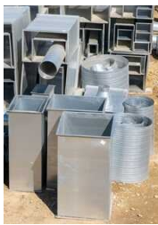
GALVANIZED IRON DUCTS

Beam Clamps, Cable Tray Couplers, Cable Tray Cover Clamp, Cover Clamp, EN-08 Enclosure, EN-20 Enclosure, GI 4Way Cross Bend, GI Cable Tray Cover, GI Horizontal Bends, GI Inward Bending Tray, GI Perforated Tray, GI Press Fitting Cable Tray, GI Raceway Tray, GI Street Light Poles, GI Tray Type Ladder, etc.