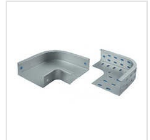
GI Horizontal Bends