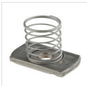
Spring Nut For Utility Channels