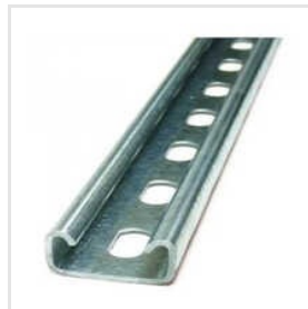
Support Channel With Inward Bend