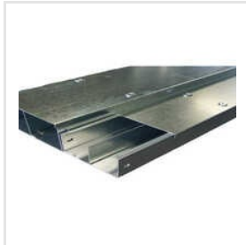
GI Trunking With Partition