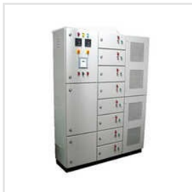
Industrial Control Panels