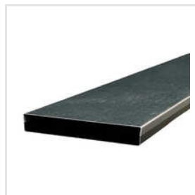
GI Cable Tray Cover