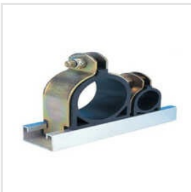
Pipe Clamps For Utility Channels