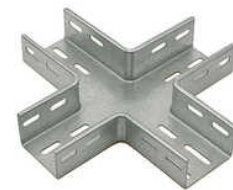
GI 4WAY CROSS BEND