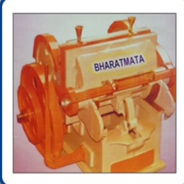
Die Punching Machine

Die Cutting Creasing Machine, Die Cutting Punching Machine, Embossing With Punching Machine, Foil Stamping Machine, Hot Foil Stamping Machine, Industrial Die Cutting Creasing Machine, etc.