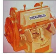
1900 KG Die Punching Machine