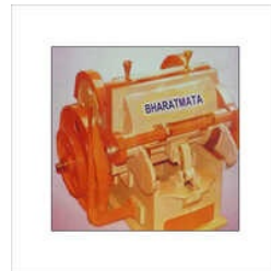
3000 KG DIE PUNCHING MACHINE