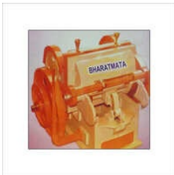
1700KG DIE CUTTING CREASING MACHINE

Die Cutting Creasing Machine, Die Cutting Punching Machine, Embossing With Punching Machine, Foil Stamping Machine, Hot Foil Stamping Machine, Industrial Die Cutting Creasing Machine, etc.