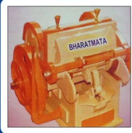
Die Cutting Creasing Machines