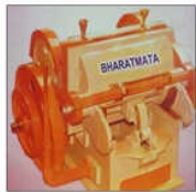
1700KG Die Cutting Creasing Machine