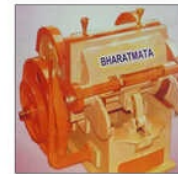
1900KG Die Cutting Creasing Machine