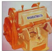
Semi Automatic Foil Stamping Machine