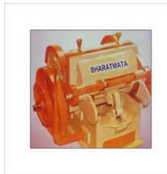
1900KG DIE CUTTING CREASING MACHINE