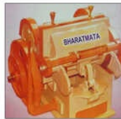
2100 KG Die Punching Machine