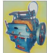
Heavy Duty Embossing Machine