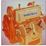
3000 KG Die Punching Machine