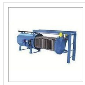
Horizontal Pressure Leaf Filter