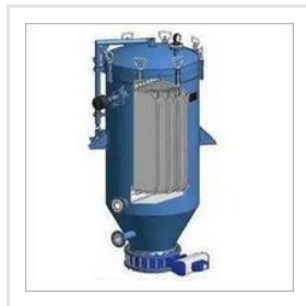
Vertical Pressure Leaf Filters