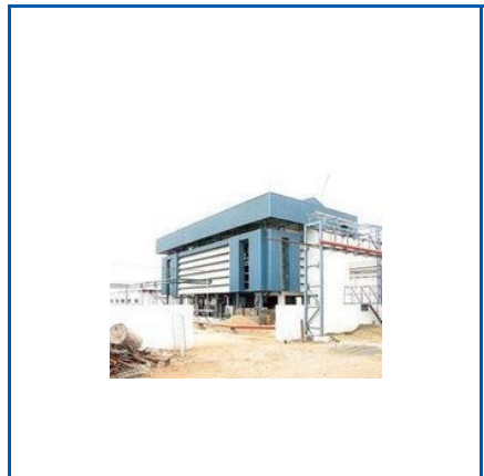
VEGETABLE OIL SOLVENT EXTRACTION PLANT