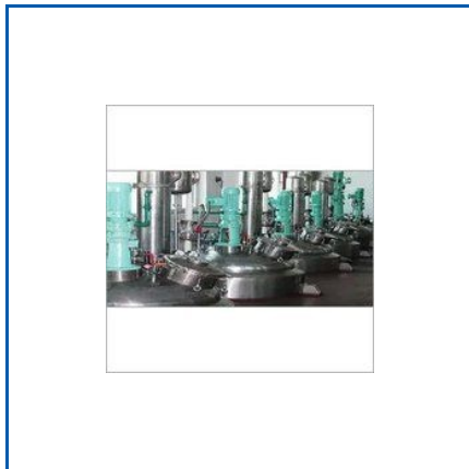
EDIBLE OIL REFINERY PLANT