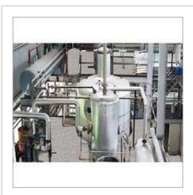
Oil Refinery Plant