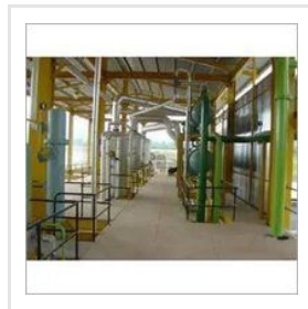
Rice Bran Solvent Extraction Plant