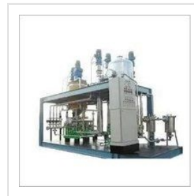
Soya Lecithin Plant