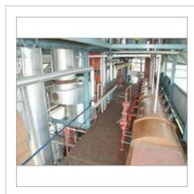
Vegetable Oil Refinery Plant