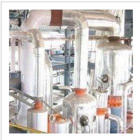
Solvent Extraction Plant