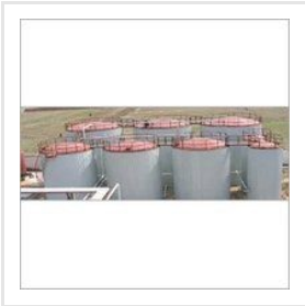
Cocoa Butter Deodorizer Machine