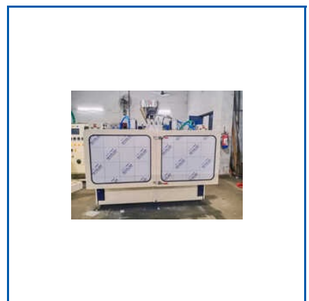
2 LTR AUTOMATIC DOUBLE HEAD DOUBLE STAGE BLOW MOLDING MACHINE