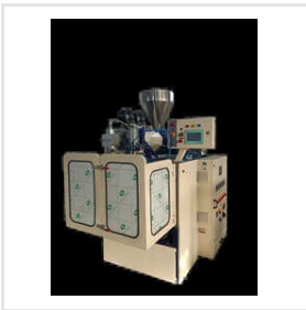
1 Liter Single Head Single Stage With