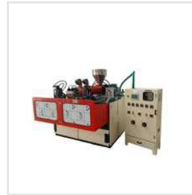
Computerized Blow Molding Machine