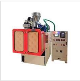
2 Ltr Double Head Single Stage Blow