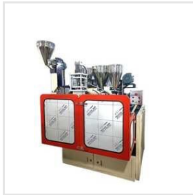
1 Ltr Triple Layer With V-Strip Blow Moulding