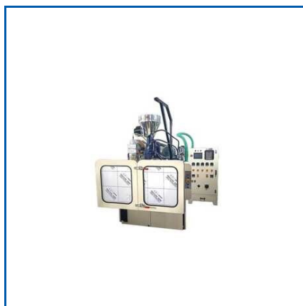
1 LTR SINGLE HEAD SINGLE STAGE BLOW MOULDING MACHINE