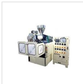
Automatic HDPE Blow Molding Machine