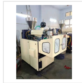
PP Blow Molding Machine