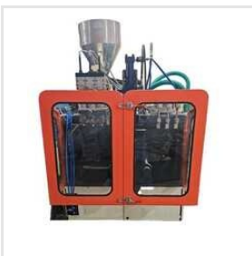
Continuous Extrusion Blow Molding Machine