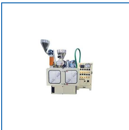
HDPE BLOW MOULDING MACHINE

1 Liter Automatic Triple Head Double Stage Blow Molding Machine, 1 Liter Blow Moulding Machine With Auto-deflashing System, 1 Liter Single Head Single Stage With Panel Inbuild Feature Blow Moulding Machine, 1 Ltr Automatic Blow Molding Machine, 1 Ltr Automatic Blow Moulding Machine With V-Strip Attachment, 1 Ltr Automatic Double Head Double Stage Blow Molding Machine, 1 Ltr Single Head Single Stage Blow Moulding Machine, etc.