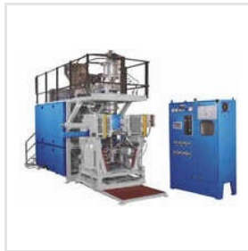
20 Ltr Automatic Blow Molding Machine