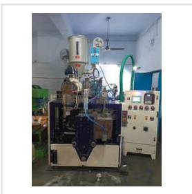
2 Ltr Single Head Single Stage With Hopper