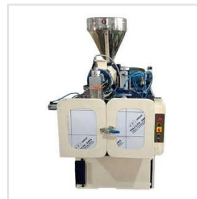
250 ML Automatic Blow Moulding Machine