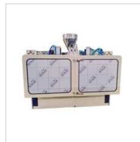
500 ML Double Head Double Stage Blow