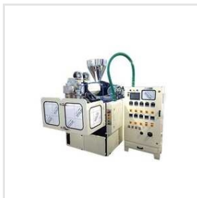
1 Ltr Single Head Single Stage Blow Moulding