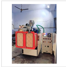
Pharmaceutical Industry Blow Molding