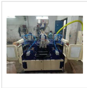
Computerized HDPE Blow Molding Machine