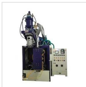
5 Ltr Accumulator Head Blow Moulding