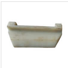
RT-3706 White GFN Liner