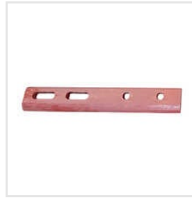
CR100 Fish Plate