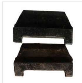
T-3738 Metal Liner