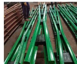
1 IN 8.5 BUILTUP CROSSING