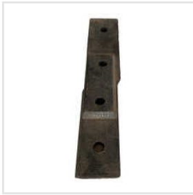
Combination Fish Plate