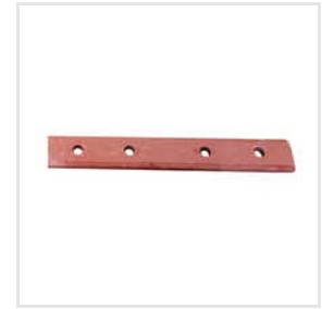
CR120 Fish Plate