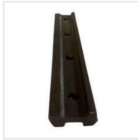
610 MM Long Fish Plate