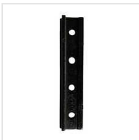
Standard Fish Plate