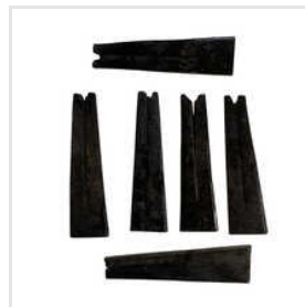
T-401 MS Cotter