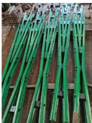
1 IN 12 BUILTUP CROSSING

1 In 12 Builtup Crossing, 1 In 8.5 Builtup Crossing, 52 KG 1 In 8.5 CMS Crossing, 60 KG Joggled Fish Plate With Clamp, 610 MM Long Fish Plate, CR100 Fish Plate, CR120 Fish Plate, CR80 Fish Plate Set, Cast Iron Check Rail Block, Combination Fish Plate, Dod Spike, J Clip, Pull Rod For Hand Lever Box, RT-10773 Single Coil Spring Washer, RT-1801 Modified Loose Jaw, etc.