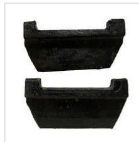
T-3740 Metal Liner