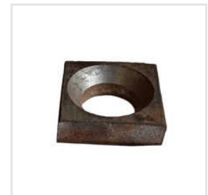
T-023 M Spherical Washer BG