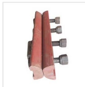
CR80 Fish Plate Set