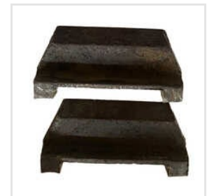
T-3742 Metal Liner