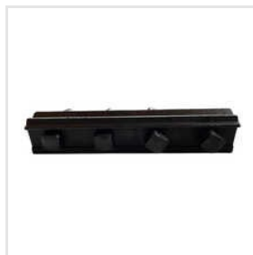
T-059 Standard Fish Plate