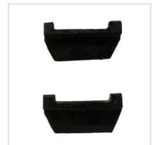
T-3741 Metal Liner