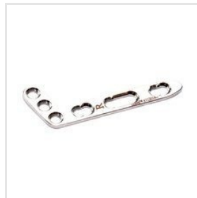
2.4 MM LCP Dorsal L Distal Radius Plate