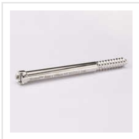
8 MM PFN Bolt Cannulated