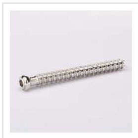
6.5 MM Full Thread Cannulated