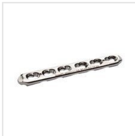
3.5 MM Small Compression Locking