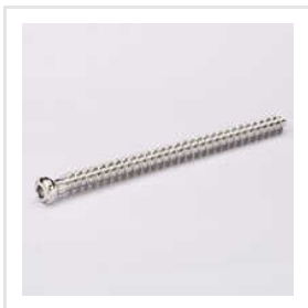
4 MM Full Thread Cannulated