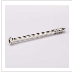
6.5 MM Cannulated Cancellous Screw