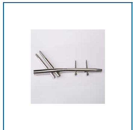
INTERLOCKING TROCHANTERIC FEMUR NAIL ( TFN )