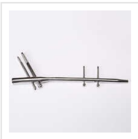
Interlocking Proximal Femur Nail ( PFN )