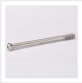
4 MM Short Thread Cannulated