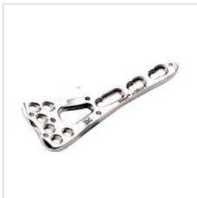
2.4 MM LCP Volar Two-Column Distal Radius