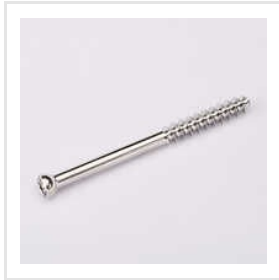
6.5 MM Cannulated Cancellous Screw