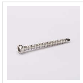
4.5 MM Interlocking Bolt