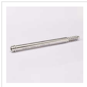
6.4 MM PFN Bolt Cannulated