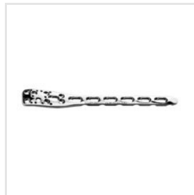
3.5 MM Proximal Humerus Locking Plate