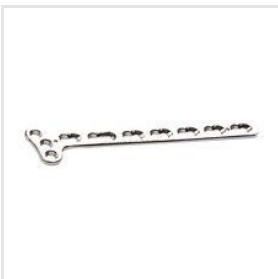
3.5 MM Oblique Locking Small T Plate