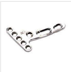
2.4 MM LCP Volar Distal Buttress Plate Right