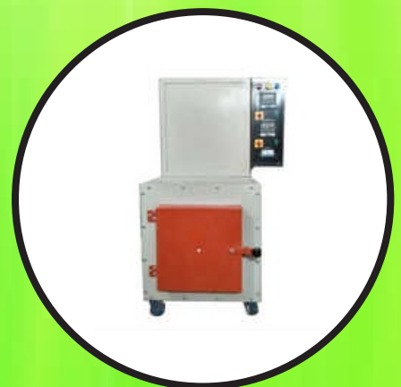
Lab Portable Incinerator