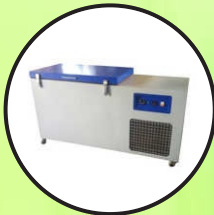
Horizontal Deep Freezer