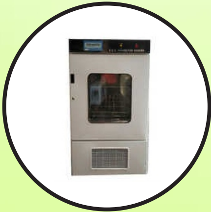
BOD Incubator Shaker