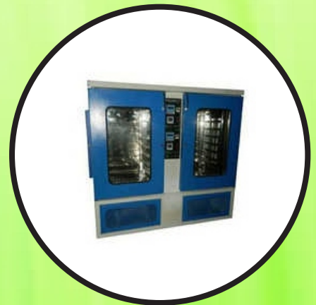
Double Chamber Seed Germinator