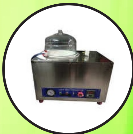
Leak Test Apparatus