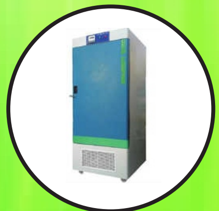
Vertical Deep Freezer