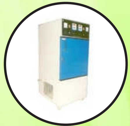
Laboratory Humidity Chamber