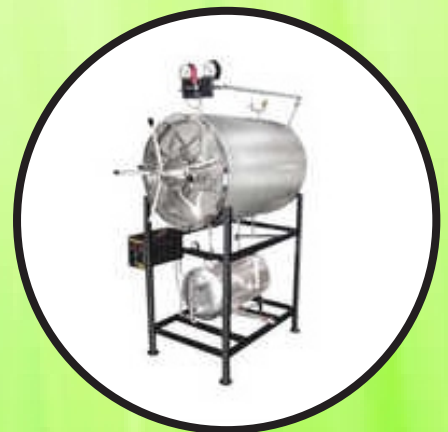
Horizontal Autoclave Steam Sterilizer