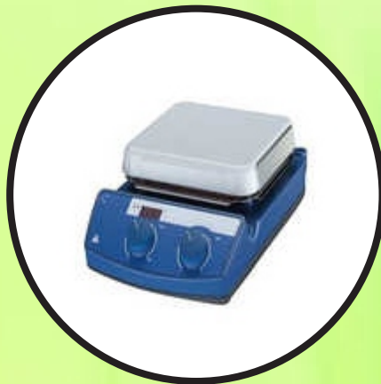
Laboratory Magnetic Stirrer