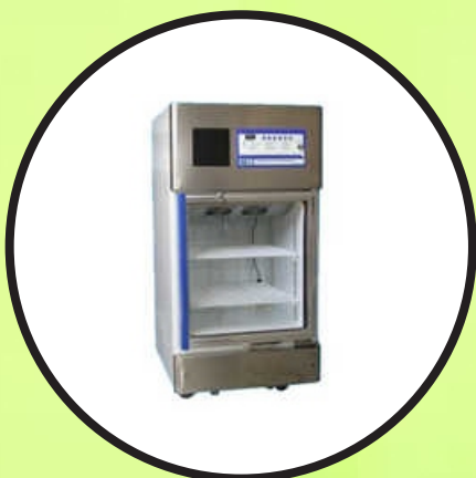
Blood Bank Refrigerator