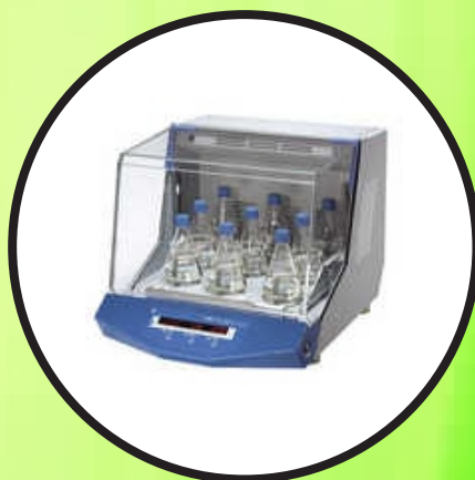
Orbital Shaking Incubator