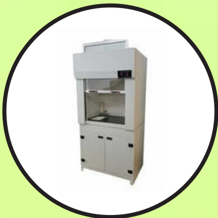
Laboratory Fume Hood