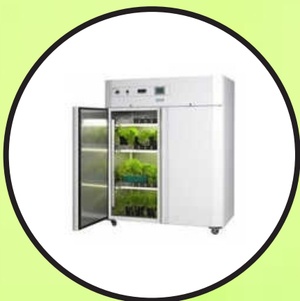
Plant Growth Chamber