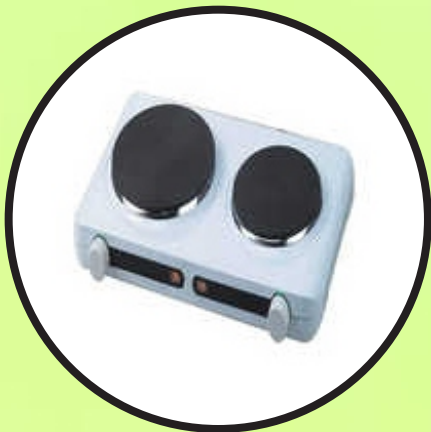
Laboratory Hot Plate