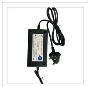
AC DC RO SMPS Adapter