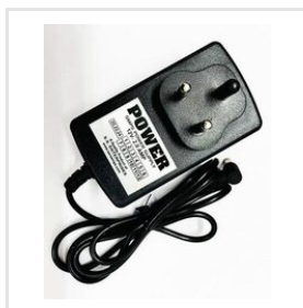
AC DC Adaptors For Set Top Box