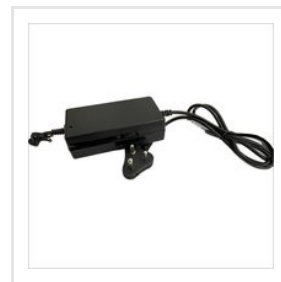
Commerical RO SMPS