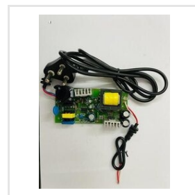
RO Power Adapter PCB