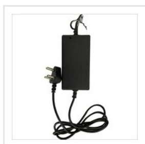
RO Water Purifier SMPS