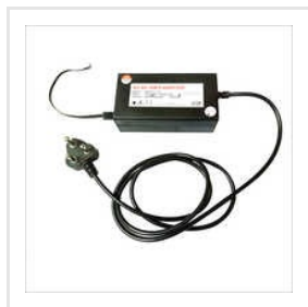
RO SMPS Power Supply Adapter