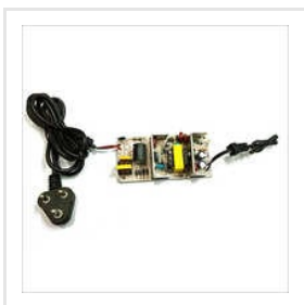
36V RO SMPS PCB