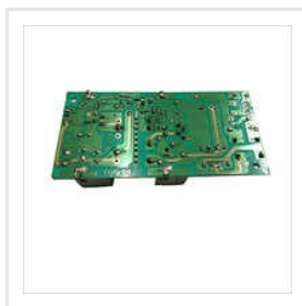
RO Power PCB Circuit