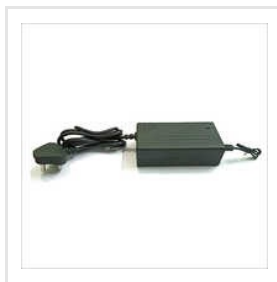
24V AC DC RO SMPS Adapter