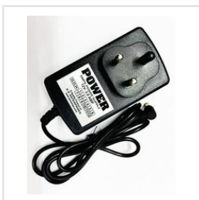
AC DC Adaptors For CCTV Camera (12V -