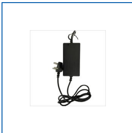
RO UV SMPS