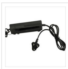
RO Power Supply