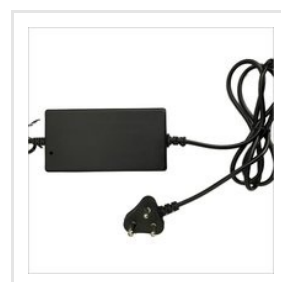
RO SMPS Supply