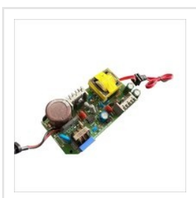
Industrial Power Supply