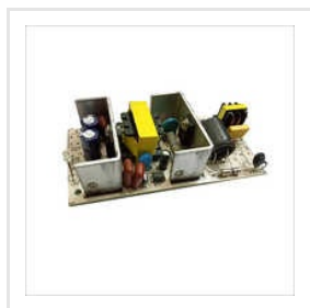
24V RO SMPS PCB