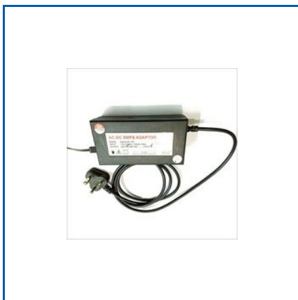
36V RO SMPS ADAPTER

24V AC DC RO SMPS Adapter, 24V RO SMPS PCB, 36V RO SMPS Adapter, 36V RO SMPS PCB, AC DC Adaptors For CCTV Camera (12V – 2A), AC DC Adaptors For Set Top Box, AC DC RO SMPS Adapter, Commerical RO SMPS, EV CHARGER 48V-15AMP, EV CHARGER 60V-10AMP, EV CHARGER 60V-12AMP, EV CHARGER 72V-8AMP, EV Charger 48v-6amp, Electric Vehicle Charger, Ev Charger 48V-15AMP, etc.