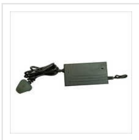
RO SMPS Power Adapter