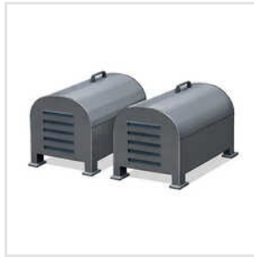
FRP Transformer Canopy