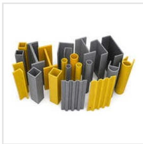
FRP Omega Profile