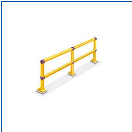
FRP HANDRAIL FOR SOLAR ROOFTOP

Chequered Plate Grating, Electroformed Grating, FRP Angle, FRP Box Pipe, FRP C-Channel, FRP Cable Tray, FRP Cooling Tower Profile, FRP Drain- Trench Cover Grating, FRP Epoxy Profile, FRP Fencing, FRP Grating, FRP Grating For Bulding Elevation Grating, FRP Grating with Chequered Plate, FRP Hand-Lay Up Canopy, FRP Handrail For Chemical Industries, etc.