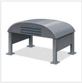
FRP Motor Canopy