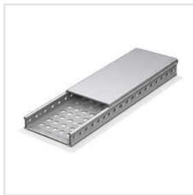
GI Cable Tray