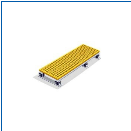
FRP WALKWAYS GRATING