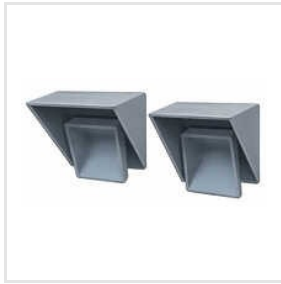
FRP Instrumentation Canopy