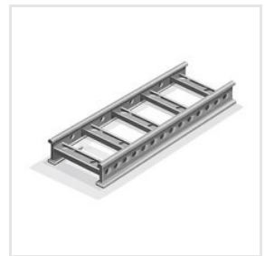
FRP Cable Tray