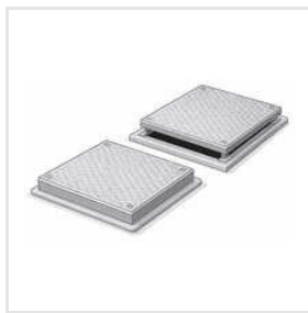
FRP Manhole Covers