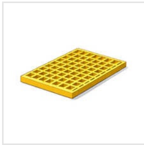
FRP Moulded Grating