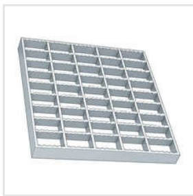
MS Grating With Powder Coated Finish