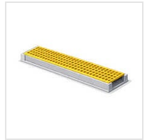
FRP Grating With Chequered Plate