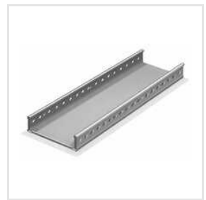
FRP Ladder Type Cable Tray