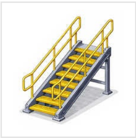
FRP Stair Trade-Step Grating-Step Trade