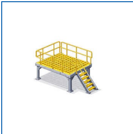
FRP PLATFORM GRATING