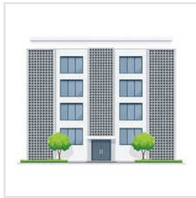
FRP Grating For Building Elevation Grating