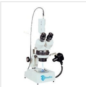
Binocular Zoom Stereoscopic