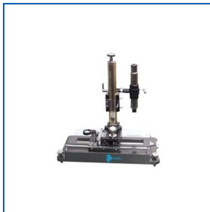
VERNIER AND TRAVELING MICROSCOPE