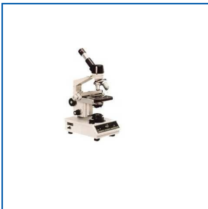
MEDICAL MONOCULAR MICROSCOPE

ADVANCE ROTARY MANUAL MICROTOME, Advance Research Binocular Microscope, Advance Rotary Manual Microtome, Advanced Binocular Coaxial Research Microscope, Advanced Rotary Microtome Histo Cut, Air Curtain, Air Shower, Ampoule Filling And Sealing Machine, Ampoule Washing Device, Analgesio Meter, Anti Biotic Zone Reader, Antibiotic Zone Reader, Aseptic Cabinet, Atomizing Humidifier, Auto Karl Fischer Titrimeter, etc.