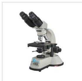
Advanced Binocular Coaxial Research