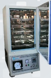
Blood Bank Refrigerator