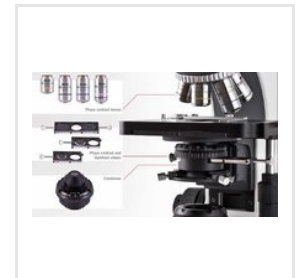
Phase Contrast Equipment