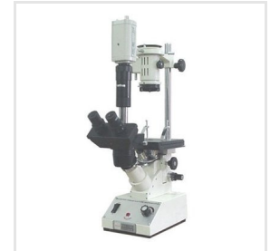
Trinocular Inverted Microscope