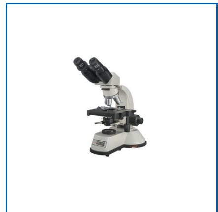
ADVANCE RESEARCH BINOCULAR MICROSCOPE