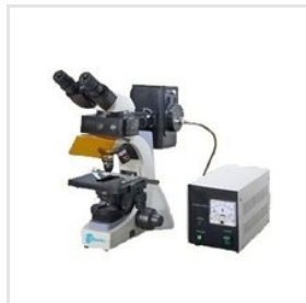
Binocular Fluorescence Microscope