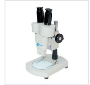
Stereo Binocular Microscope