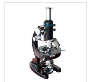
Student Polarizing Microscope