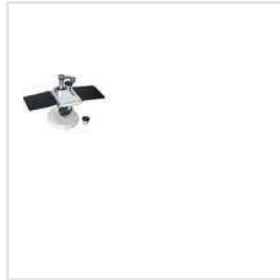
Student Dissecting Microscope