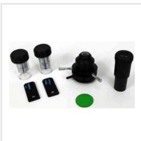
Dark Field Equipment For Research