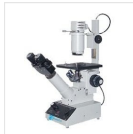
Binocular Inverted Tissue Culture