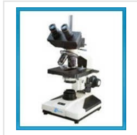
Trinocular Research Microscope