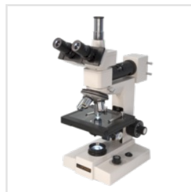
Metallurgical Trinocular Microscope