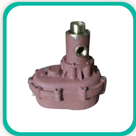
Custom Made Gear Boxes