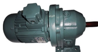
Helical Geared Motor