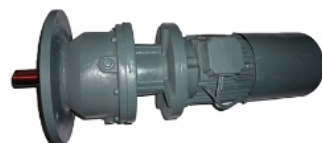
Flange Mounted Gear Motor With Brake