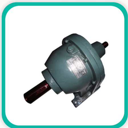
Ratio Gear Box