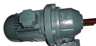
Ac Geared Motor