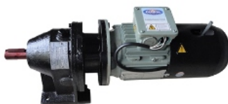
Foot Mounted Geared Motor With Brake