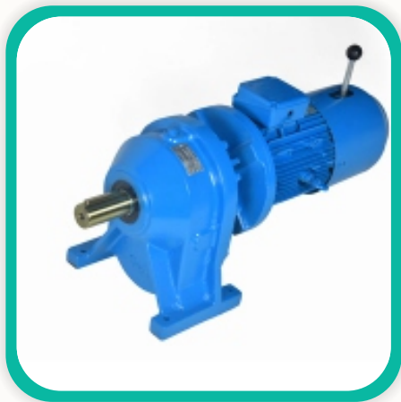
Inline Helical Geared Motor With Brake