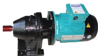
Foot Mounted Geared Motor