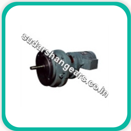
Flange Mounted Geared Motor