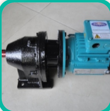
Horizontal Foot Mounted Gear Motor