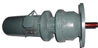
Flange Mounted Helical Gear Motor