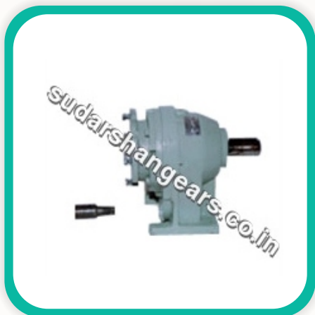
Adaptor Helical Gear Box