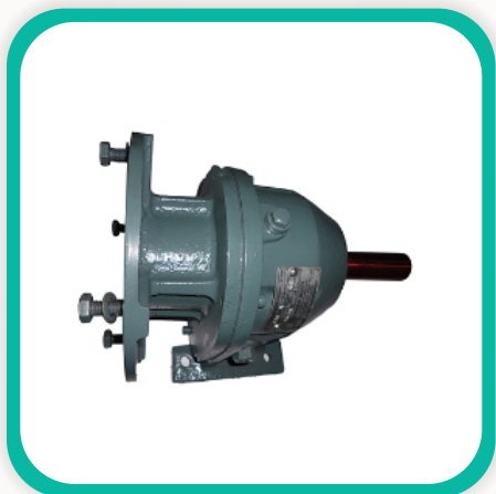
Helical Foot Mounted Gearbox