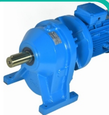
Inline Helical Geared Motor