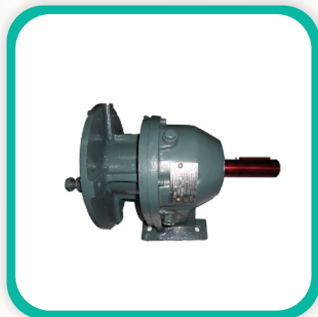
Foot Mounted Helical Gear Box