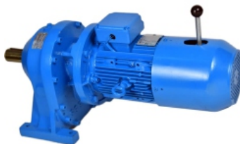
Car Parking Geared Motors