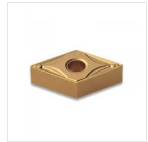
Industrial Korloy Carbide Inserts