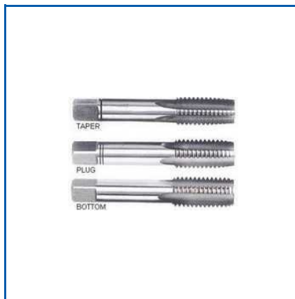
HSS THREADING TAPS SETS