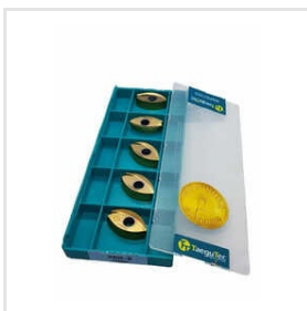
Taegutec Carbide Insert