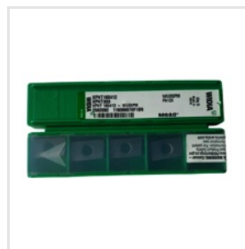
Industrial Widia Carbide Inserts