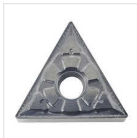
Korloy Carbide Inserts