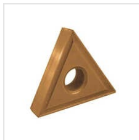
Kyocera Carbide Inserts