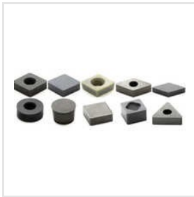
5 Mm Tungsten Carbide Insert