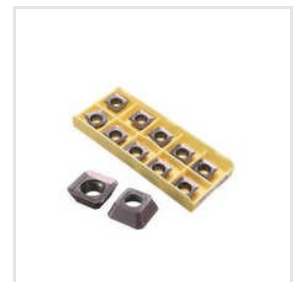
Tungsten Carbide Insert