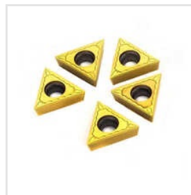
Carbide Cermet Inserts