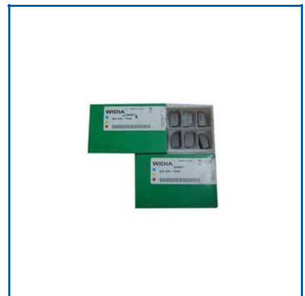
WIDIA CARBIDE INSERTS