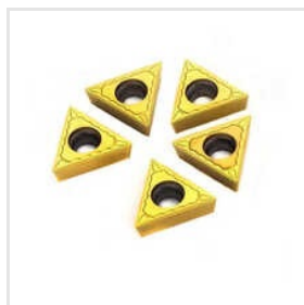
Turning Carbide Insert