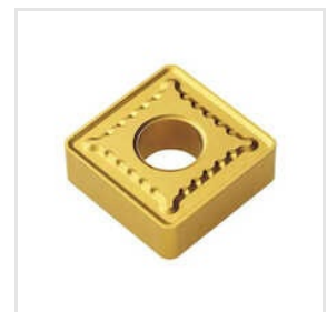
Korloy Carbide Inserts