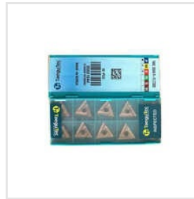
Taegutec Insert TNMG Knife Insert