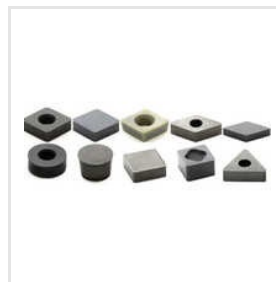
Ceramic Turning Insert