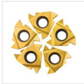
National Trading Tungsten Carbide