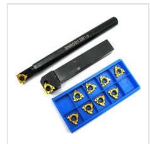
Internal Threading Inserts