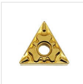
CNC Turning Inserts