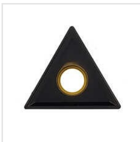
Tungsten Carbide Insert