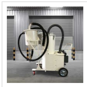
3000SC FR Flux Recovery Unit