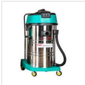
Vacklin 80 Commercial Vacuum