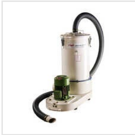
Portable Dust Extractor