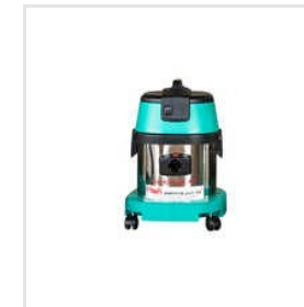
Vacklin 20 Commercial Vacuum Cleaner