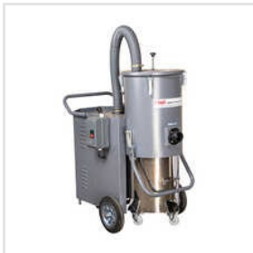
SC Series Industrial Vacuum Cleaner