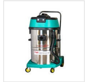
Vacklin 60 Commercial Vacuum Cleaner