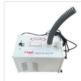
Fume Extractor For Laser Soldering