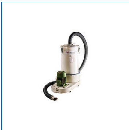
PORTABLE DUST EXTRACTOR

200D Portable Dust Extractor, 3000SC FR Flux Recovery Unit, Fume Extractor For Laser Soldering, Heavy Duty Industrial Vacuum Cleaner, MT Series Textile Vacuum Cleaner, Portable Dust Extractor, SC Series Industrial Vacuum Cleaner, Vacklin 20 Commercial Vacuum Cleaner, Vacklin 30 Commercial Vacuum Cleaner, Vacklin 60 Commercial Vacuum Cleaner, Vacklin 80 Commercial Vacuum Cleaner, etc.