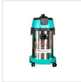
Vacklin 30 Commercial Vacuum Cleaner