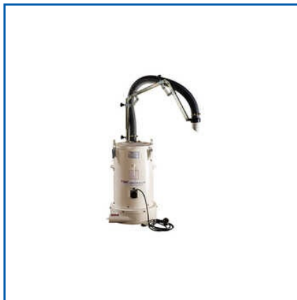
200D PORTABLE DUST EXTRACTOR