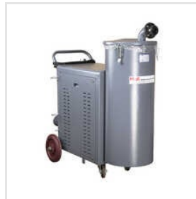
MT Series Textile Vacuum Cleaner