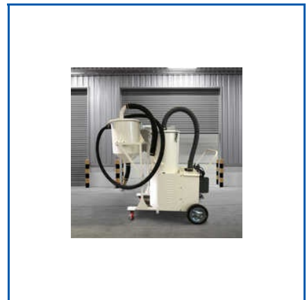
3000SC FR FLUX RECOVERY UNIT