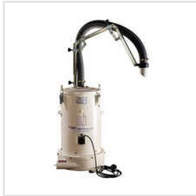
200D Portable Dust Extractor