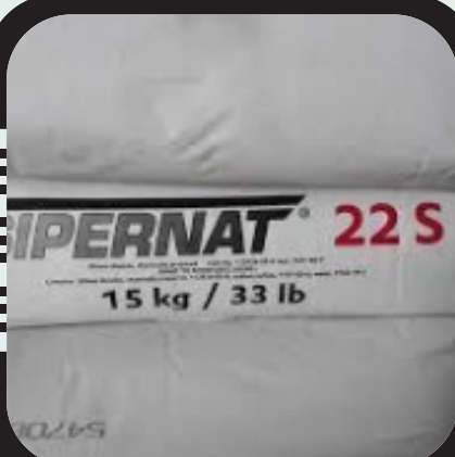
Potassium sipernat 22s