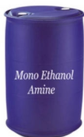
Mono Ethanol Amine