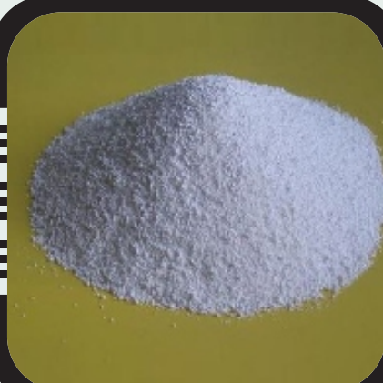
Potassium Sulphate Tech