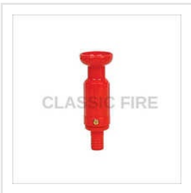
PVC Hose Reel Nozzle