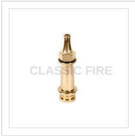
Fire Short Branch Pipe