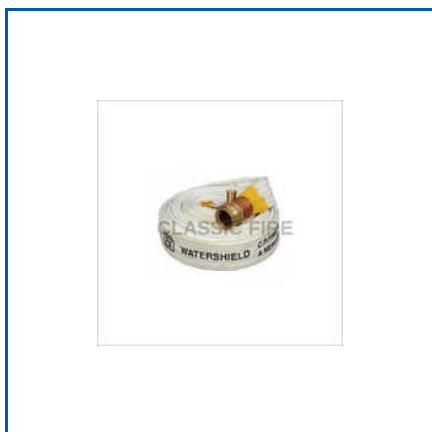
CONTROLLED PERCOLATING HOSE PIPE