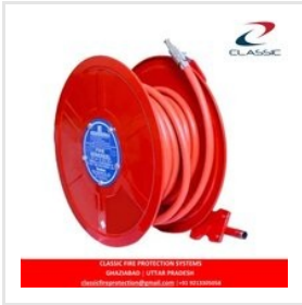
NEWAGE FIRE HOSE REEL