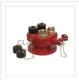
Four Way Inlet Valves