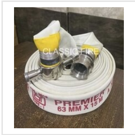
NEWAGE PREMIER RRL HOSE WITH SS