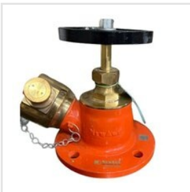
NEWAGE HYDRANT VALVE GM