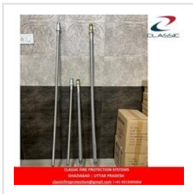
NEWAGE FLEXIBLE SPRINKLER HOSE