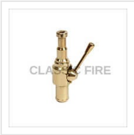
Gun Metal Hose Reel Nozzle