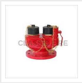
Two Way Inlet Impellers