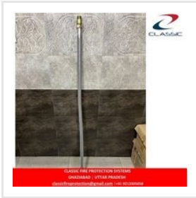
NEWAGE FIRE SPRINKLER HOSE