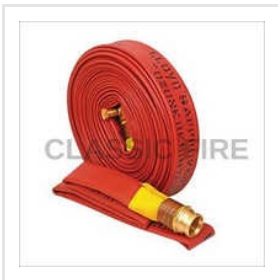
RRL Hose Pipes