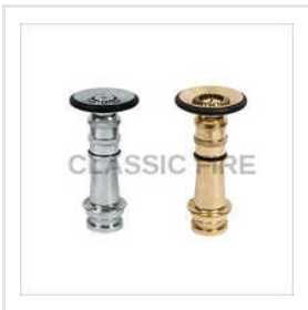
Triple Purpose Nozzle