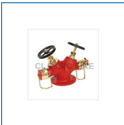
DOUBLE HEADED HYDRANT VALVE

ABC Fire Extinguisher, Aqua Foam Nozzle, Automatic ABC Modular Fire Extinguisher, Automatic Clean Agent Modular Fire Extinguisher, CO2 Fire Extinguisher, Clean Agent Fire Extinguisher, Controlled Percolating Hose Pipe, Double Headed Hydrant Valve, FRP Tank Mobile Foam, Fire Detection Alarm System, Fire Fighting Water Monitor, Fire Hydrant System, Fire Short Branch Pipe, Fire Sprinkler System, Fire Trolley Mounted Monitor, etc.