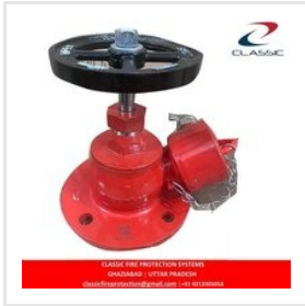
NEWAGE HYDRANT VALVE SS