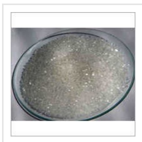
Magnesium Sulphate Monohydrate