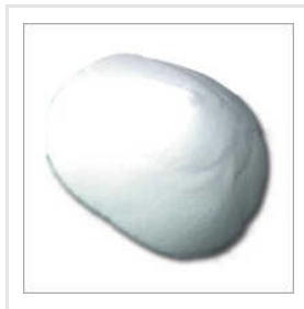
Zinc Sulphate Heptahydrate