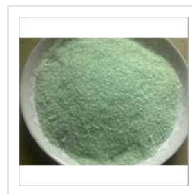
Ferrous Sulphate Monohydrate