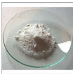
AMMONIUM FERROUS SULPHATE HEXAHYDRATE