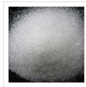
Magnesium Sulphate Heptahydrate