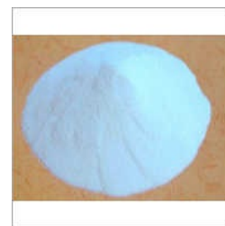
COPPER SULPHATE MONOHYDRATE ANHYDROUS