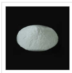
Zinc Sulphate Monohydrate