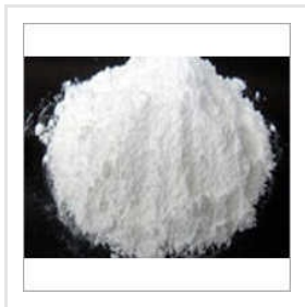
Sodium Acetate Trihydrate Anhydrous