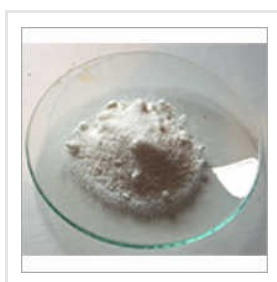
Ammonium Ferrous Sulphate Hexahydrate