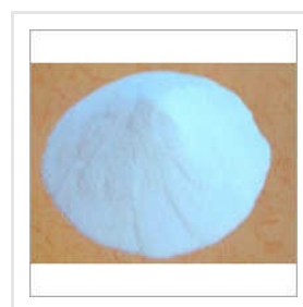
Copper Sulphate Monohydrate