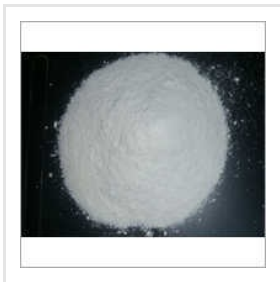
Sodium Sulphate Anhydrous