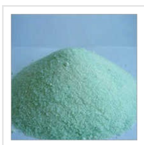
Ferrous Sulphate Heptahydrate