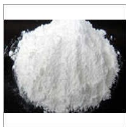
SODIUM ACETATE TRIHYDRATE ANHYDROUS

Ammonium Ferrous Sulphate Hexahydrate, Cobalt Sulphate, Copper Sulphate Monohydrate Anhydrous, Copper Sulphate Pentahydrate, Ferrous Sulphate Heptahydrate, Ferrous Sulphate Monohydrate, Magnesium Sulphate Heptahydrate, Magnesium Sulphate Monohydrate Anhydrous, Sodium Acetate Trihydrate Anhydrous, Sodium Sulphate Anhydrous, Zinc Sulphate Heptahydrate, Zinc Sulphate Monohydrate, etc.