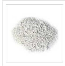
Refractory White Accmon 45