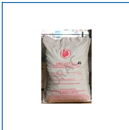
LOW CEMENT CASTABLE REFRACTORIES