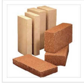
Furnace Fire Clay Fire Brick Refractory