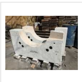
Induction Furnace Top And Bottom Block