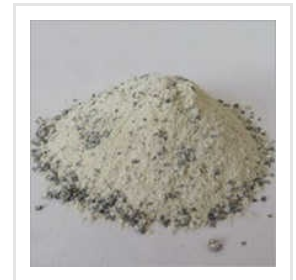
Neutral Ramming Mass