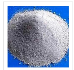
25 Kg Accmon 45 Refractory Powder