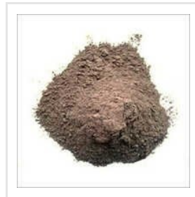
Insulating Castable Refractories