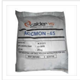
Accmon 45 Powder