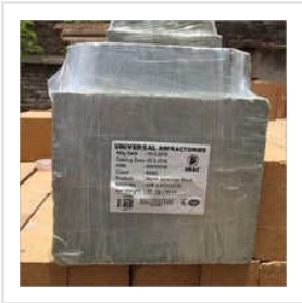
Electrical Crematorium Refractory Shape Brick