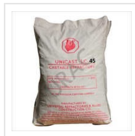
Refractory Accmon 45 Lc Castable Or Unicast