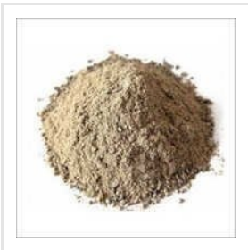
Conventional Castable Refractories