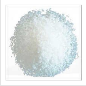
Acidic Ramming Mass