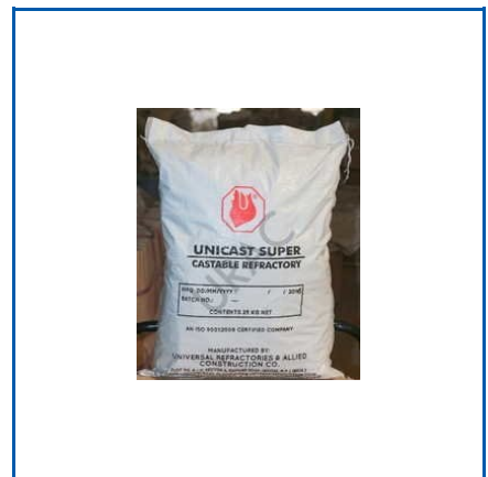
UNICAST SUPER REFRACTORY CASTABLE