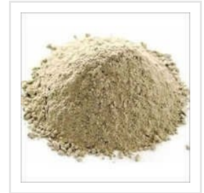
Basic Patching Mass