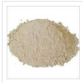
High Alumina Castables Refractories