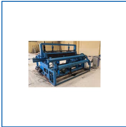
UPTO 2 MM AUTOMATIC CRIMPED WIRE MACHINE