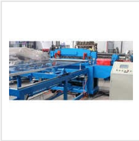
Fully Automatic Welded Wire Mesh