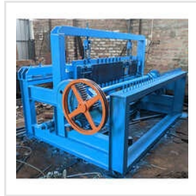
Industrial Mechanical Crimped Wire Mesh