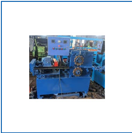
UPTO 12 MM AUTOMATIC CRIMPED WIRE MACHINE

Automatic Self Cleaning Crimped Wire Mesh Machine, Automatic Wire Straightening Machine, Fully Automatic Hydraulic Press Clamping Machine, Fully Automatic Welded Wire Mesh Machine, Hydraulic Crimped Wire Mesh Machine, Industrial Mechanical Crimped Wire Mesh Machine, Upto 12 MM Automatic Crimped Wire Machine, etc.