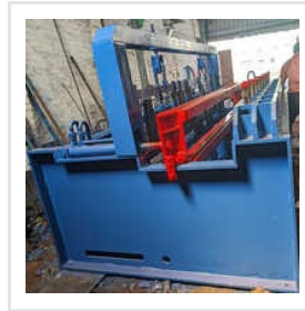
Hydraulic Crimped Wire Mesh Machine