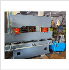
Fully Automatic Hydraulic Press