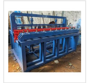
Hydraulic Crimped Wire Mesh Machine