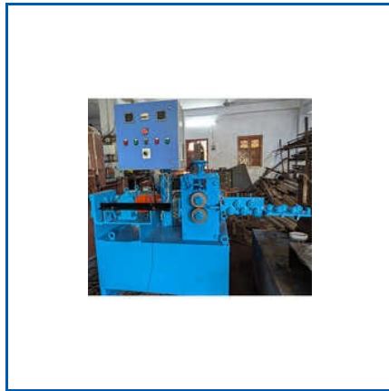
UPTO 6 MM AUTOMATIC CRIMPED WIRE MACHINE