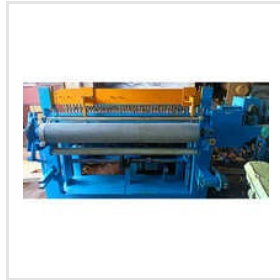
Welded Wire Mesh Machine