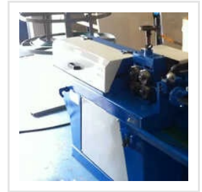
Automatic Wire Straightening Machine