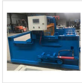
Automatic Self Cleaning Crimped Wire