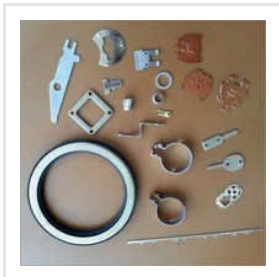
Sheet Metal Components