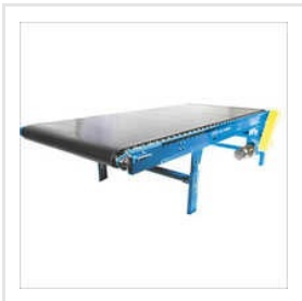
Easy Move Belt Conveyor