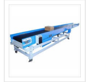
Loading Unloading Conveyor