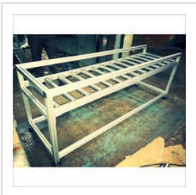
Fifo Roller Conveyor System