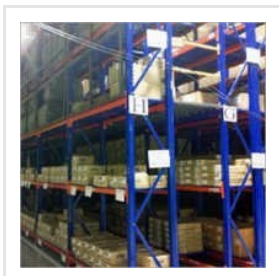
Heavy Duty Racks