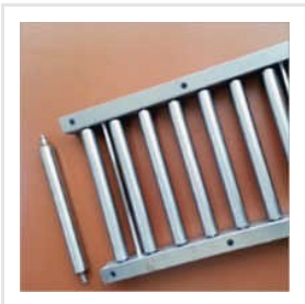
Steel Roller Conveyors