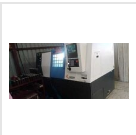
CNC Turning Components