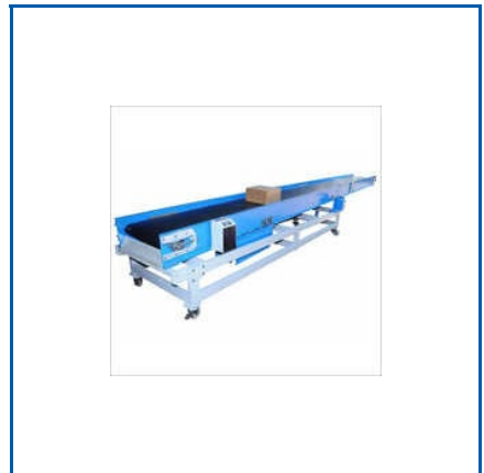
LOADING UNLOADING CONVEYOR