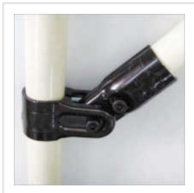
Pipe And Joints