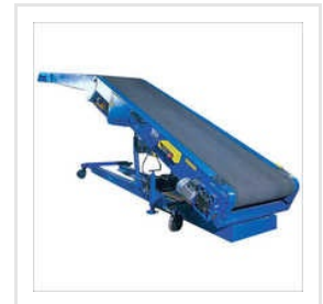
Telescopic Belt Conveyors