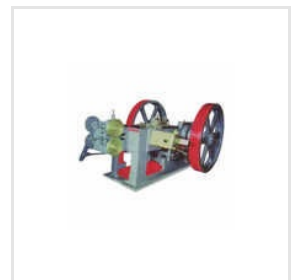
MS Cold Forge Heading Machine