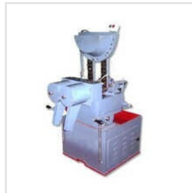
Nut Tapping Double Spindle Machines