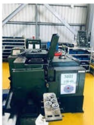
7.5 HP MULTI STATION NUT FORMER MACHINES

100HP Nut Making Machine, 220V Bolt Former Machine, 3 Hp Nut Former Machine, 5 Hp Nut Former Machines, 7.5 Hp Multi Station Nut Former Machines, Automatic Bolt Making Machines, Automatic Bolt Making Plant, Automatic Nut Tapping Double Spindle Machine, Bolt Former Machine, Cold Bolt Former Machines, Cold Forging Bolt Former Machine, Fully Automatic Trimming Machine, MS Cold Forge Heading Machine, MS Nut Making Plant, MS Tapping Machines, etc.