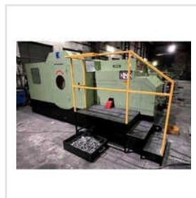
100HP Nut Making Machine