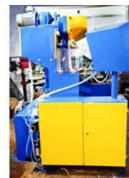
PNEUMATIC FOUR SPINDLE NUT TAPPING MACHINE