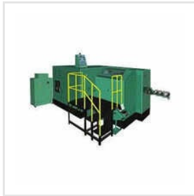
Bolt Former Machine