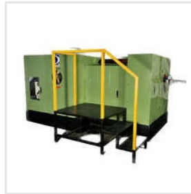
Multi Station Bolt Former Machine