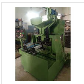
MS Tapping Machines