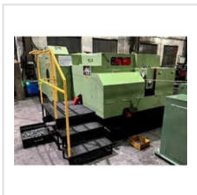
220V Bolt Former Machine