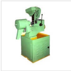
Nut Tapping Single Spindle Machine