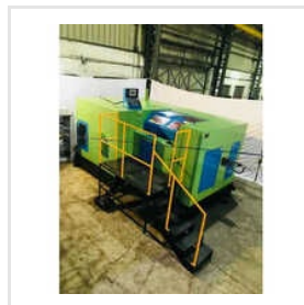
Cold Bolt Former Machines