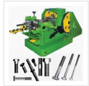
Automatic Bolt Making Plant