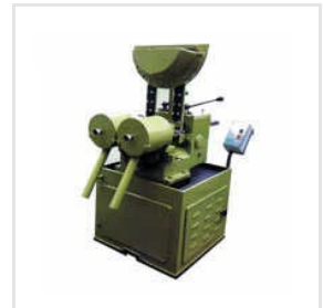
Automatic Nut Tapping Double