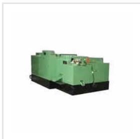
5 Hp Nut Former Machines