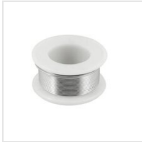
Solder Alloy Wire