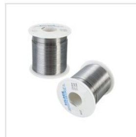
Flux Cored Solder Wires