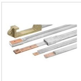
Lead Plating Anodes