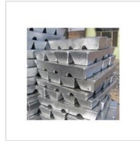
Lead Metal Ingots