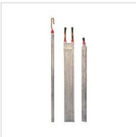
Pure Tin Lead Anodes