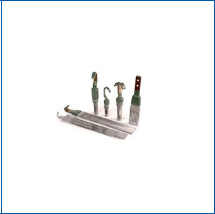
CHROME PLATING ANODES