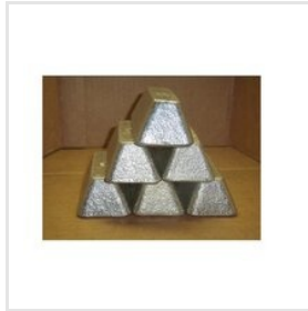
Lead Tin Ingots