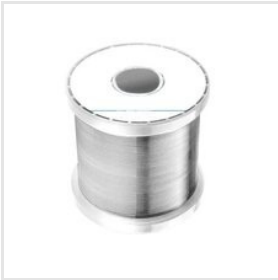
Solid Solder Wires