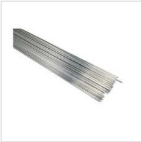
Aluminum Jointing Rod