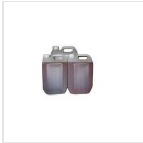
Solder Tinning Flux