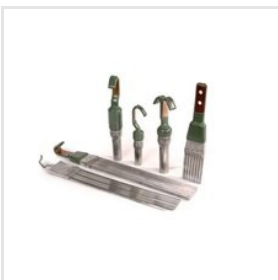
Chrome Plating Anodes