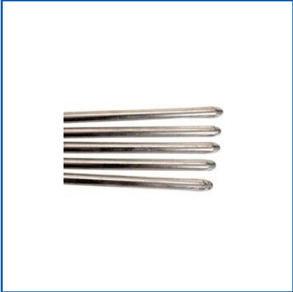
ROHS SOLDER STICK

Aluminum Jointing Rod, Chrome Plating Anodes, Flux Cored Solder Wires, Isobutyl Alcohol, Isopropyl Alcohol, Lead Metal Ingots, Lead Plating Anodes, Lead Tin Ingots, N Butyl Acetate, No-Clean Flux, Pure Tin Lead Anodes, ROHS Solder Stick, ROHS Solder Wires, Solder Alloy Wire, Solder Tinning Flux, etc.