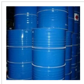
N Butyl Acetate