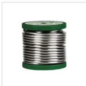
ROHS Solder Wires