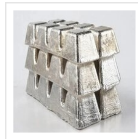
Tin Metal Ingots