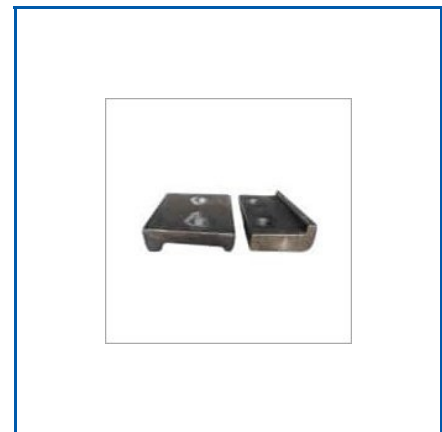
FORGED RAIL CLAMP