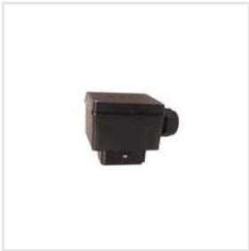
End Power Feed