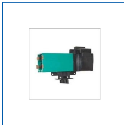
BOX TYPE DSL SYSTEM