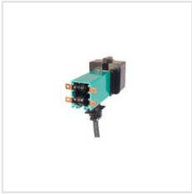
Box Type DSL