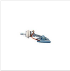
Gravity Type Current Collector