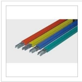
Dsl Busbar System