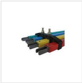
Pin Type DSL System