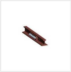
Rail With Joint