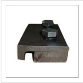
Angle Type Rail Clamps