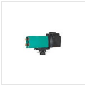
Box Type DSL With End Power Feed