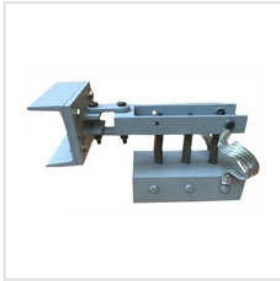
Earth Current Collector