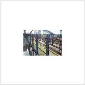
Angel Iron DSL System