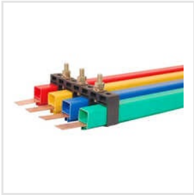
Jointless DSL System