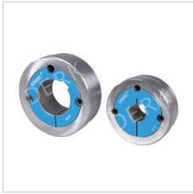
Taper Bush Weld On Hub Pulley