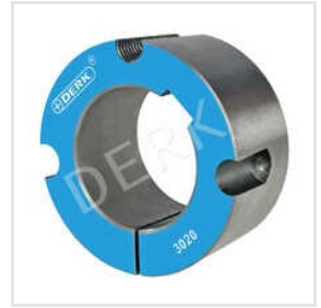
Taper Bushes Pulley