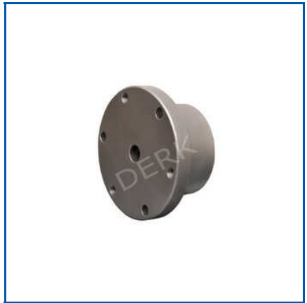
QD BUSHING PULLEY