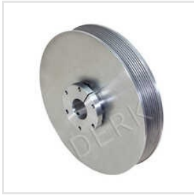
Poly V Belt Pulley