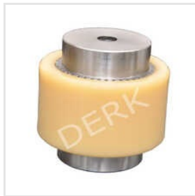
Nylon Gear Coupling