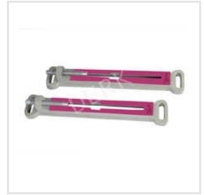
Motor Slide Rails