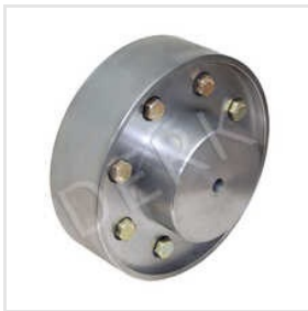
Pinbush Type Flexible Coupling