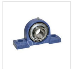
UCP Type Bearing Unit