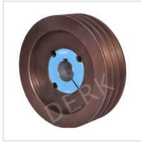
Taper Bush Pulley