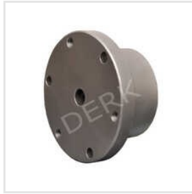
QD Bushing Pulley