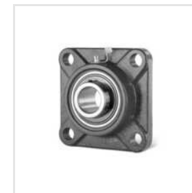
UCF Type Bearing Unit