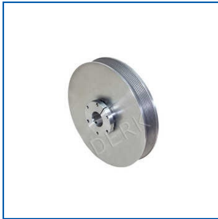
POLY V BELT PULLEY