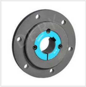
Taper Bush Bolt On Hub Pulley