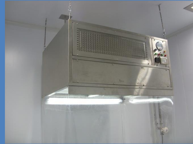
Ceiling Suspended Laminar Air Flow