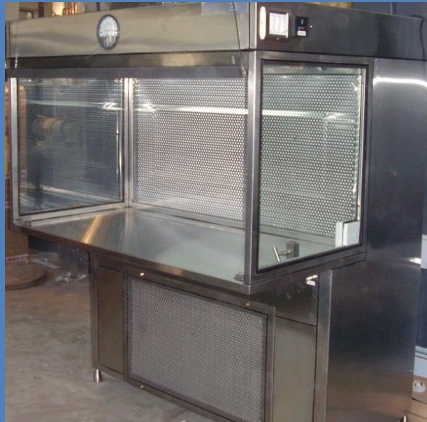
Horizontal Laminar Air Flow Bench