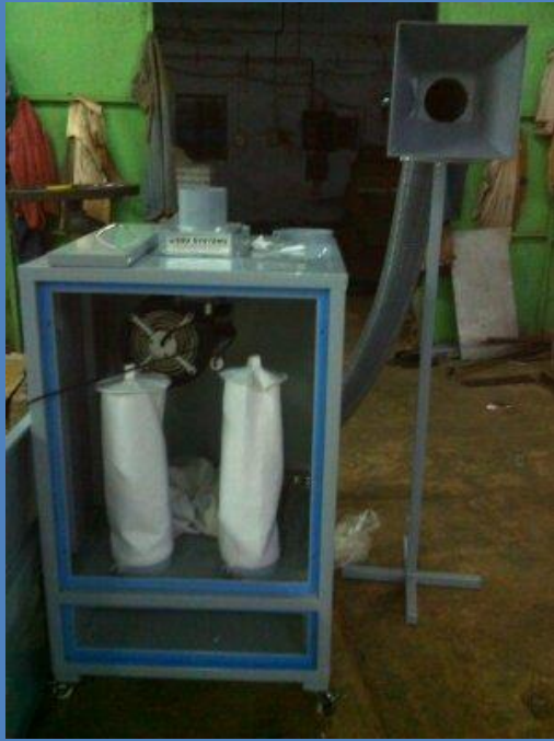
Mobile Dust Collector