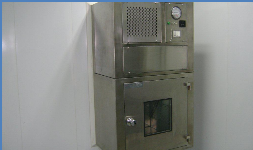
Dynamic Pass Box