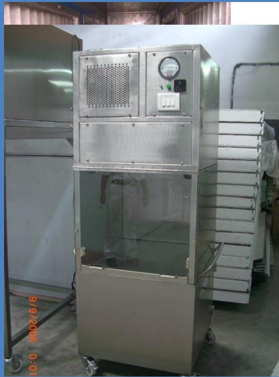
Mobile Dynamic Pass Box