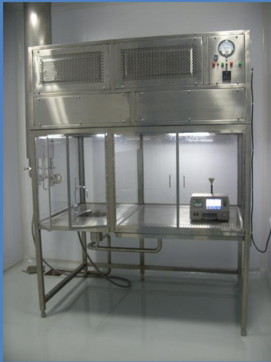
Laminar Air Flow with Sink