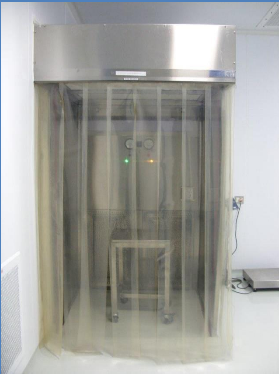
Sampling Booth / Dispensing Booth