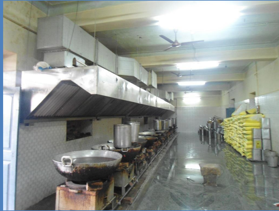
Kitchen Exhaust Hood