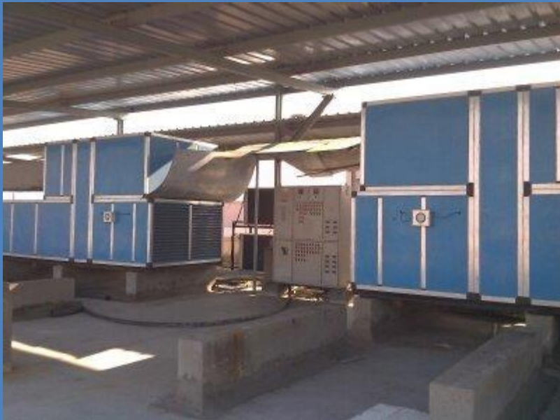
Air Handling Unit With Heat Recovery Wheel & Electrical Heaters