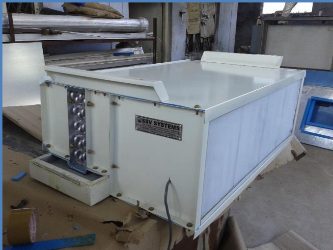
Fan Coil Unit