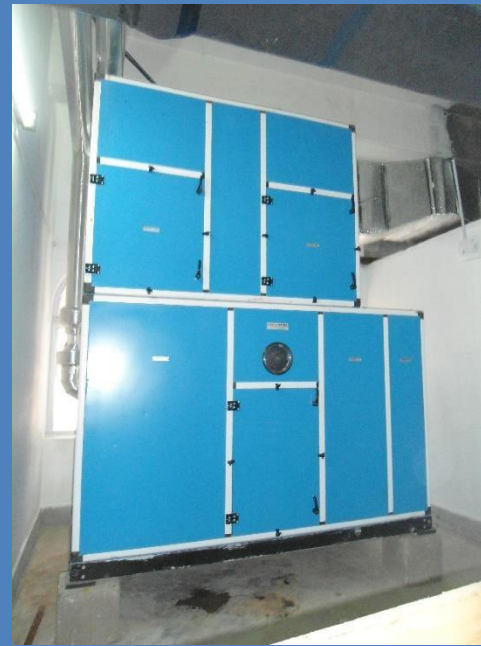
Two Tier Air Handling Unit