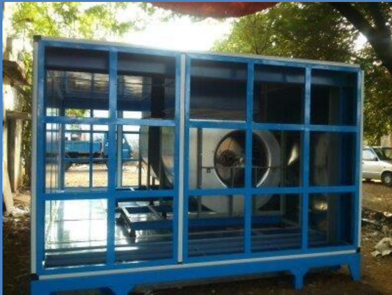
Twin Blower Air Cooling Unit