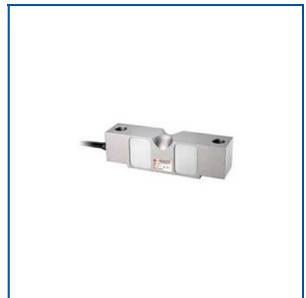
HEAVY DUTY LOAD CELL