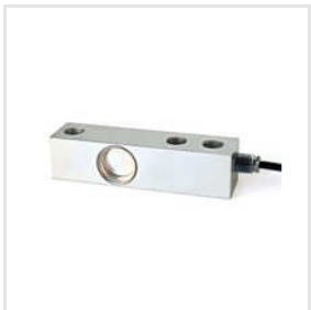
Shear Beam Load Cell