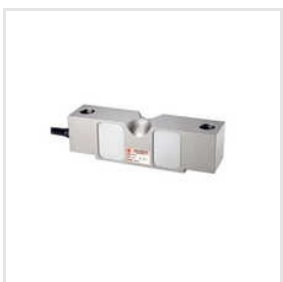
Double Ended Beam Load Cell