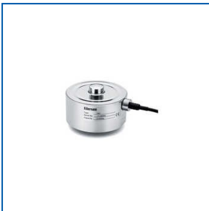
DIGITAL LOAD CELLS

30 Ton Compression Load Cell, Alloy Steel Load Cell, Button Load Cell, Commercial Weighing Scale, Compression Load Cell, Computerized Weighbridge, Concrete Platform Weighbridge, Digital Compression Load Cell, Digital Load Cells, Digital Weighbridge, Double Ended Beam Load Cell, Fully Electronic Weighbridge, Heavy Duty Load Cell, High Temperature Crane Scale, Industrial Crane Scale, etc.