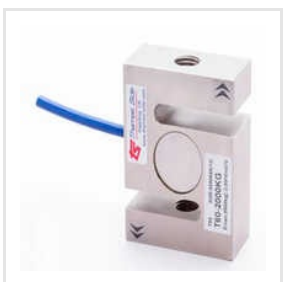
S Type Load Cell