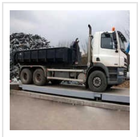
Top Loading Pitless Weighbridge