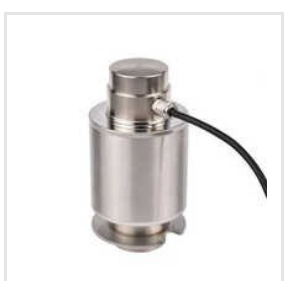
30 Ton Compression Load Cell