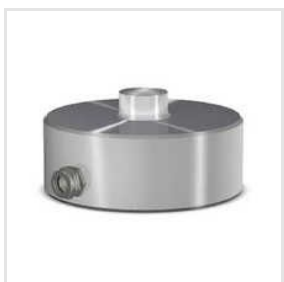
Button Load Cell