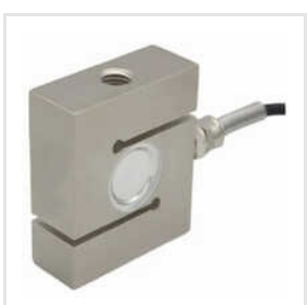
Stainless Steel Load Cell