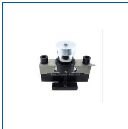
ALLOY STEEL LOAD CELL