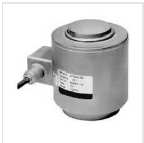
Digital Compression Load Cell