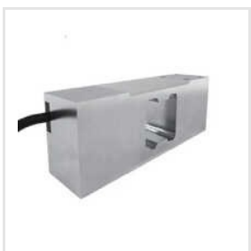
Single Point Load Cell