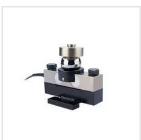
Weighbridge Load Cell