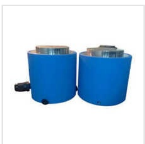
Compression Load Cell