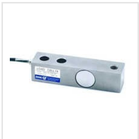
Single Ended Load Cell