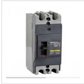
4 Pole MCCB