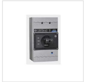
L&T T100A 3 Pole 36KA MCCB