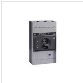
L&T 200-250 A MCCB