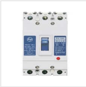
Triple Pole MCCB