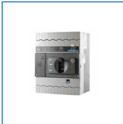
L&T CM920080OL10G MCCB