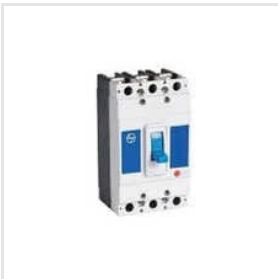
L&T 25KA 160A MCCB