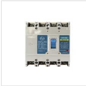
Four Pole MCCB