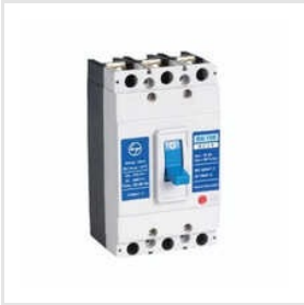
L&T CM906380ONO MCCB