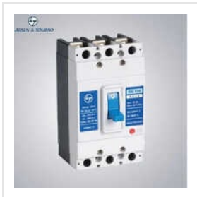
L&T CM980620000 3 Pole Molded Case