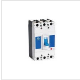
L&T CM984020ORO MCCB