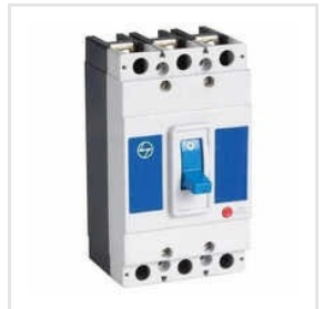
L&T SL972070000 MCCB