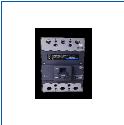
L&T CM906380OLO MCCB

2 Phase Stepping Motor RKSD507-CD, Voltage 280 V, Speed 2000-6000 RPM, 25KA Electric MCCB, 25KVAR Standard Duty Capacitor, 3 Pole MNX 22 Contactor L & T Power Contactor, 30 VDC Omron Proximity Sensor, 380 W Gear Motors, 4 Pole MCCB, 7 KVAR Cylindrical Standard Duty Capacitor, 8 Channel Relay Board, AC Drive 3G3MX2-A4004 Module, AC Flush Mounting Hour Meter, Analog Timer Switch, Ats Automatic Transfer Switch, etc.