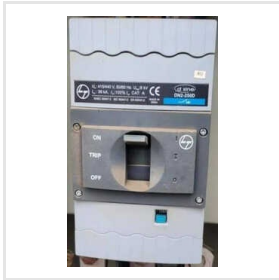
L&T 4 Pole 250A MCCB