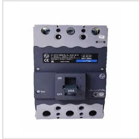
L&T CM921060OPIOG MCCB