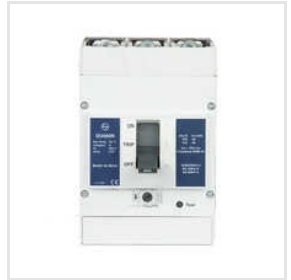
L&T CM984040ORO MCCB