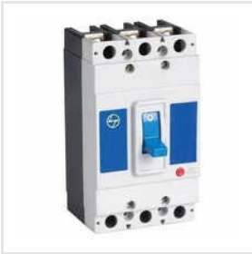
L&T CM916120OGOOG MCCB