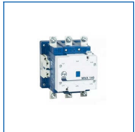
L&T MNX 140 CONTACTOR