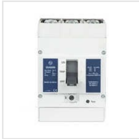
L&T 4 Pole 400A MCCB