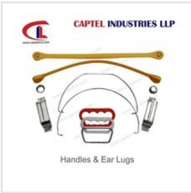
Handles And Ear Lugs For Rectangular And