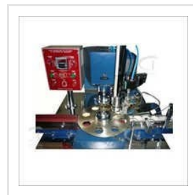
Dial And Punch Wadding Machine