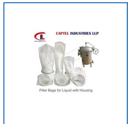
FILTER BAGS FOR LIQUID WITH HOUSING