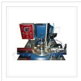
Full Option Machine With Elevator Hopper