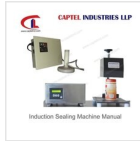
Manual Induction Sealing Machine