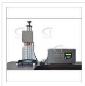
Semi Automatic Induction Sealing