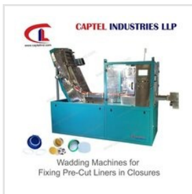
Liner Wadding Machine