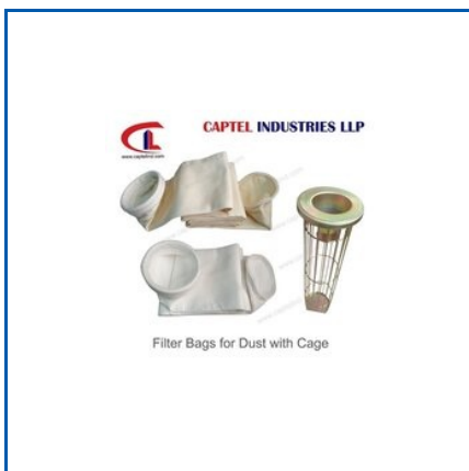
FILTER BAGS FOR DUST WITH CAGE

2 Inch Inner Plug for Jerry Cans, 28 mm CRC Closures, 28 mm TE Low weight Closures, 28 mm, 33 mm & 38 mm CRC Closures, 28mm Push Pull Closures, 3/4 Plastic Drum Cap Seals, 3/4inch Metal Drum Cap Seals, 30 ml Tablet Container, 4 Ltr Rectangular Can Top with Plastic Cap, 63 mm Flex spouts for 20 ltr Jerry Cans and Drums, 63mm FlexSpouts, Actuators, Aluminium Lidding Foil Conduction Seal, Aluminum Beverage and Pour Easy Opening Ends, etc.