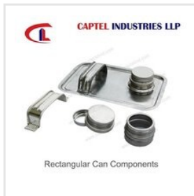
Rectangular Can Components