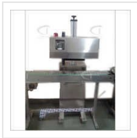
Induction Sealing Machine