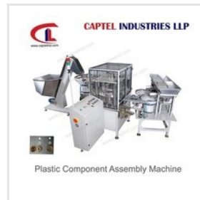
Plastic Packaging Assembly Machine