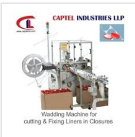
Wadding Machines For Cutting And Fixing