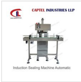
Automatic Induction Sealing Machine