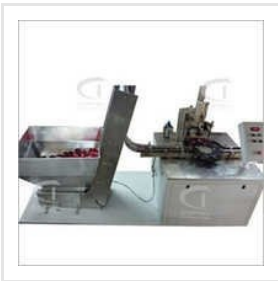
Wadding (Liner Fixing) Machines For Fixing