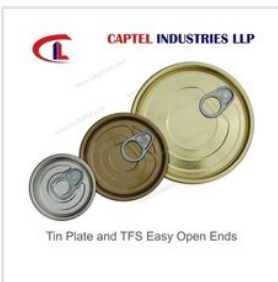
Tin Plate And TFS Easy Open Ends