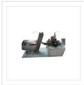
Vacum Pick & Place Wadding Machine