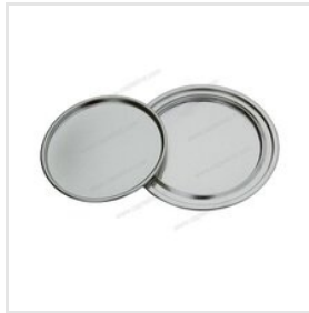
Penny Lever Lid