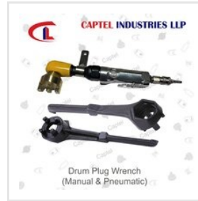
Drum Plug Wrench - Manual & Pneumatic