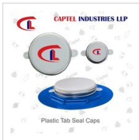
Plastic Tab Seal Caps