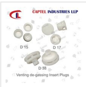
Venting De-Gassing Insert Plugs