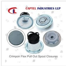
Crimpon Flex Pull Out Spout Closures