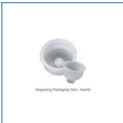
Degassing Packaging Vent - Inserts

38 mm Motor Oil Cap, 40 mm Oil Nozzle Cap, 50 mm Pull-Out Spout Closures, 63 mm Flexible Pull-Out Spout for Plastic Pails & Containers, 63 mm Pull Out Flex Spout for Tin Pails, 63mm FlexSpouts, Aluminium Easy Open Ends, Aluminium Lidding Foils, Automatic Induction Sealing Machine, Automatic Liner Cutting and Insertion Machines, Automatic Plastic Closure Assembly Machines, Barrel Tab Seal Caps, Child Resistant Closures (CRC), Collapsible DEF Flex Spout, Conical Twist Open Caps, etc.