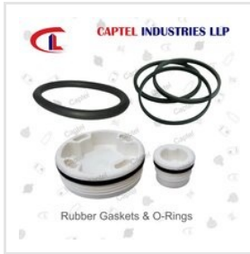
Rubber Gaskets & O-Rings