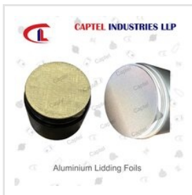
Aluminium Lidding Foils