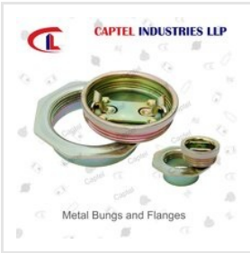
Metal Bungs And Flanges