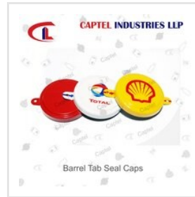
Barrel Tab Seal Caps