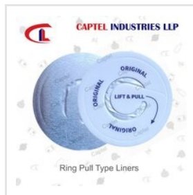
Ring Pull Type Liners