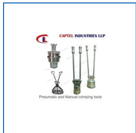
Pneumatic and Manual crimping tools