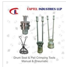
Drum Seal & Pail Crimping Tools -