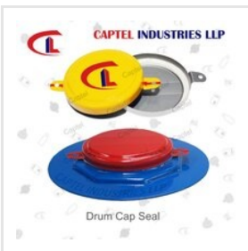
Drum Cap Seal