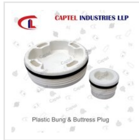
Plastic Bung & Buttress Plug