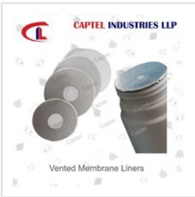
Vented Membrane Liners