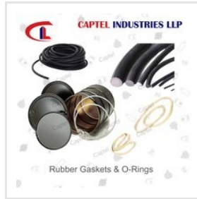
Rubber & PE Foam Cords