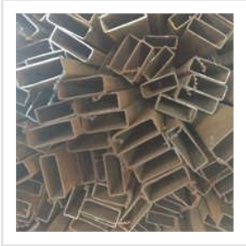
Rectangular Section Pipes