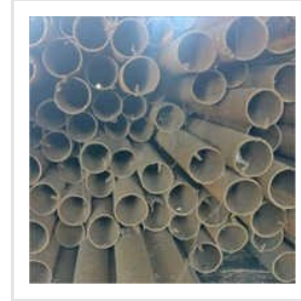
Round Section MS Pipes