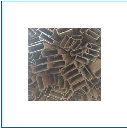
RECTANGULAR SECTION PIPES