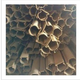
Railing Section Pipes