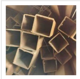
Square Section Pipes