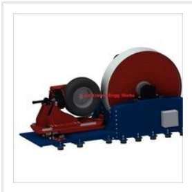
Tyre Testing Machine