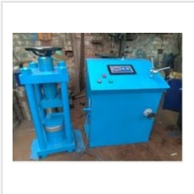
Compression Testing Machine