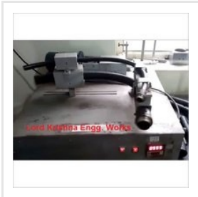
Flexure Testing Machine