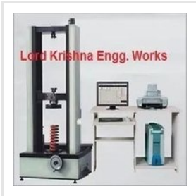
Spring Load Testing Machine