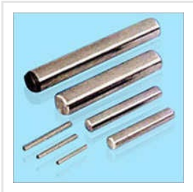
Cylindrical Pin Gauges