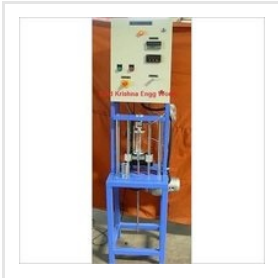
Spring Testing Machine