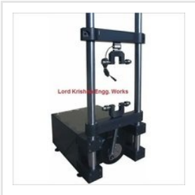
Shock Absorber Testing Machine