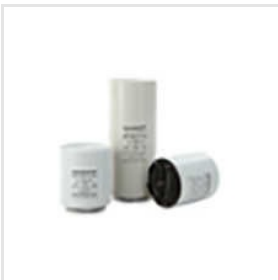
PCB Mounted DC Link Film Capacitor