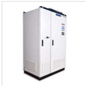
Real Time Power Factor Correction Panel