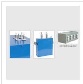
AC - DC Capacitors