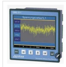
Power Quality Analyzers