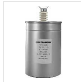
Heavy Duty AC Capacitor For Power