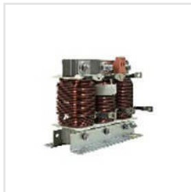
Copper Or Aluminium Three Phase Reactors