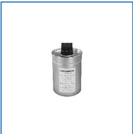
SINGLE AND THREE PHASE CAPACITORS