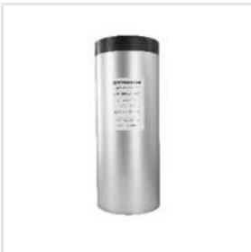
Low Inductance Capacitors DC Link