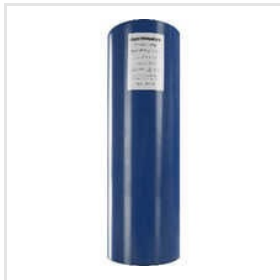
High Voltage Dc Capacitors, For Low