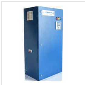
PFC And PFC Rapid