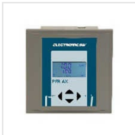
Automatic Power Factor Controller