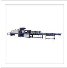
Multipack 350A Automatic Linear