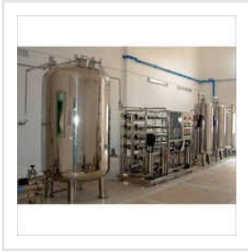
Mineral Water Plant