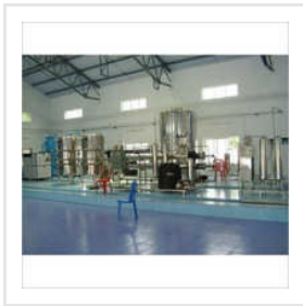
Mineral Water Plant