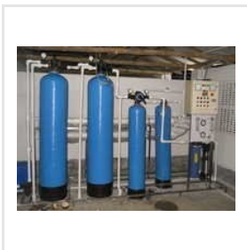
Iron Removal Plant