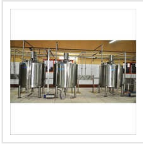
Beverage Blending Section