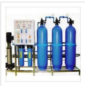
Industrial DM Plant