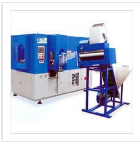
Fully Automatic Pet Blowing Machine