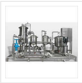
Sugar Syrup Filtration System