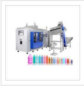
Fully Automatic Pet Bottle Blow Moulding