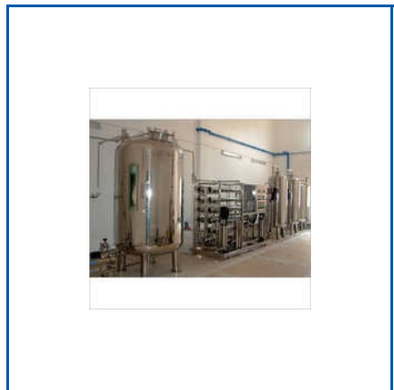
AUTOMATIC MINERAL WATER PLANTS