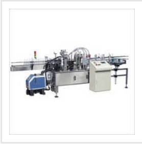
Automatic Bopp Labelling Machine