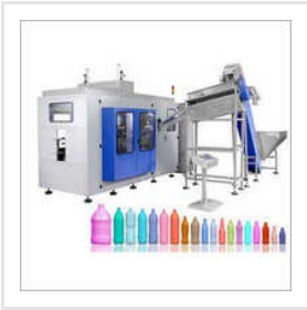
Fully Automatic Pet Bottle Blow Moulding