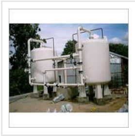
Pressure Sand Filter