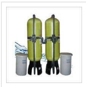
Commercial DM Plant