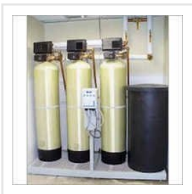
Water Treatment Iron Removal Systems