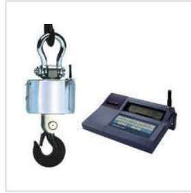
Wireless Crane Scale