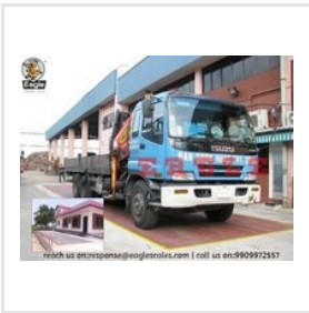
Pit Type Weighbridge