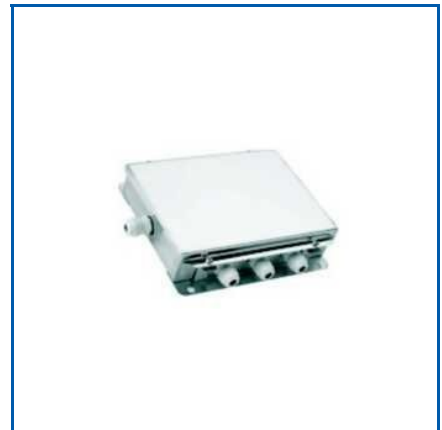
JUNCTION BOX & CORNER CARD