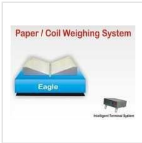
COIL PAPER WEIGMENT