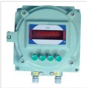
Flame Proof Indicator