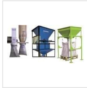
BAG FILLING MACHINE