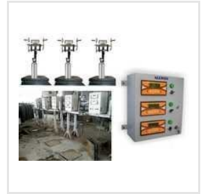
Co2 GAS FILLING MACHINE