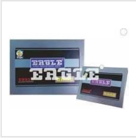
Digital Intelligent Terminal