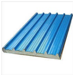
SVARN INSULATED CEILING PANELS