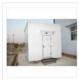
Svarn PUF Panel Telecom Shelter