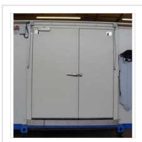
Svarn Cold Storage Double Door