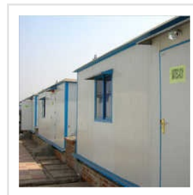
Svarn Modular Portable Cabin