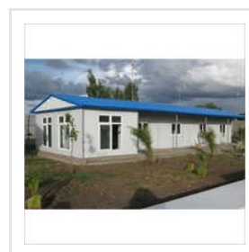
Svarn Prefabricated Portable Cabin