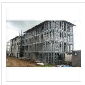
Svarn Light Gauge Steel Frame