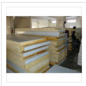
Polyurethane Foam Insulated Panel