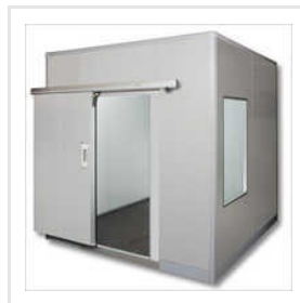
Svarn Portable Cold Storage Room