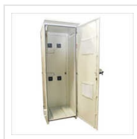
Svarn Portable Telecom Cabinet