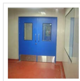
Clean Room Doors