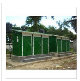
Prefab Toilet Cabin