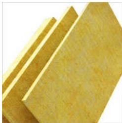
SVARN POLYURETHANE FOAM SLAB PANELS

AC Kiosk Shelter, Aluminium Foil PUF Sheet Panel, Clean Room Doors, Display Cold Room, Double Tap Water Cooler, EMI Shielded Defence Shelter, Eco Friendly Prefa Homes Construction Services, Ice Cream Cart, Industrial Portable Container Cabin, Industrial RO Plant Shelter, Industrial Telecom Shelter, Insulated Pipe, Insulated Polyurethane Foam PUF Panels, Isolation Room, Medical Disinfection Tunnel, etc.