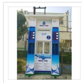
Industrial RO Plant Shelter