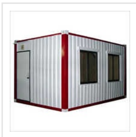
Industrial Portable Container Cabin