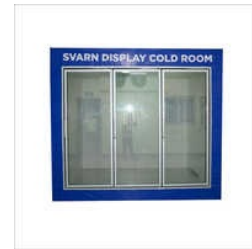
DISPLAY COLD ROOM