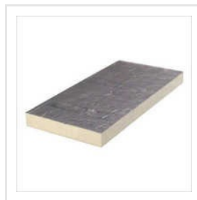
PIR Insulated Panel