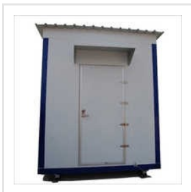
Industrial Telecom Shelter