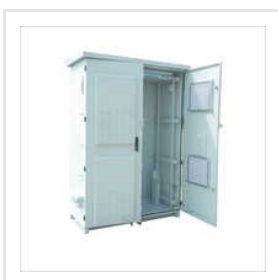
Svarn Rack Cabinet