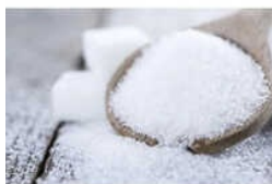
Silicone Based Defoamer