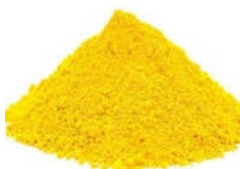
Yellow Optical Brightening Agent