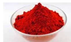
Direct Red 12b Dyes