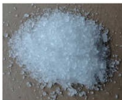
Sodium Thiosulphate Crystal