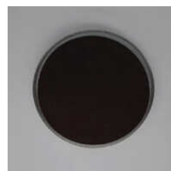
Black Nigrosine Powder