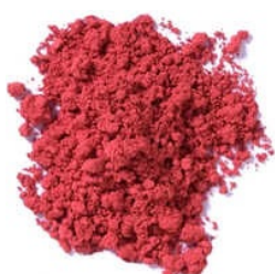
Direct Fast Dye