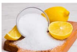
Citric Acid Monohydrate Crystals