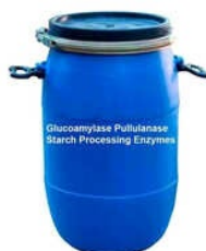
Starch Processing Enzymes