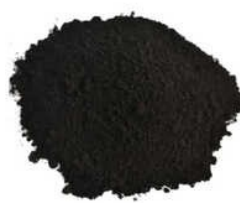
Nigrosin Black Water Soluble ODRG Dyes