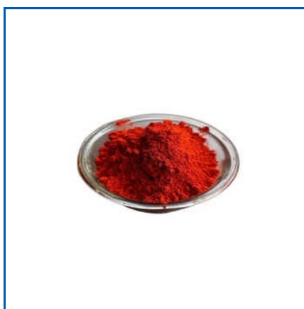
ACID ORANGE DYES