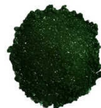
Malachite Green Dye