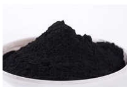
SSCRD Base Nigrosine Black Dyes