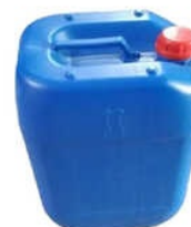
Liquid Methyl Violet Basic Dyes