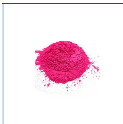
RHODAMINE B 540 DYES