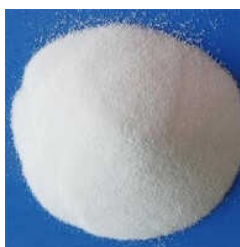
Citric Acid Monohydrate