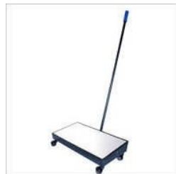
Under Vehicle Search Mirror