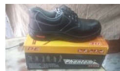
PHANTOM SAFETY SHOES