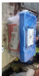
First Aid Box