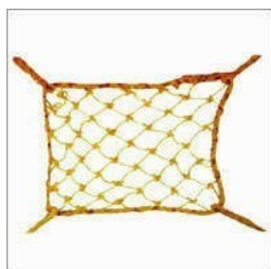
INDUSTRIAL SAFETY NETS

ABS Plastic Speed Bumps, Carabiner Carabiner, Convex Mirror, Corner Guards, Ear Plug, Fire Blanket, First Aid Box, Gumboot, Hand Held Metal Detector, Industrial Safety Nets, Life Buoy, Phantom Safety Shoes, Plastic Speed Breaker, Polycarbonate Lathi, Polycarbonate Shield, Etc.