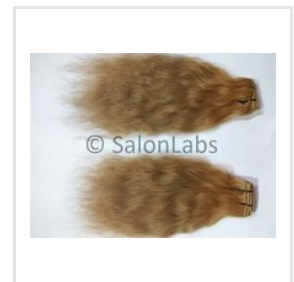
Colored Natural Hair