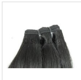
Fuller Hair Extensions