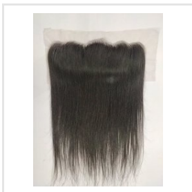
Remy Pure Lace Frontal