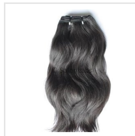
Natural Human Hair Extensions For All