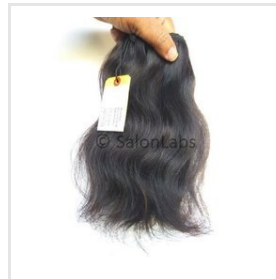
Luxurious Indian Remy Hair Extensions