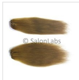
Indian Natural Hair