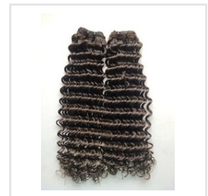
Remy Pure Machine Weft Deep Wave