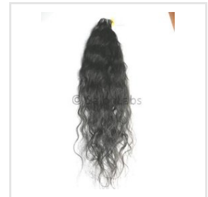
Wholesale Unprocessed Human