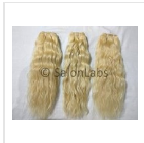
Natural Hair Extensions Blonde