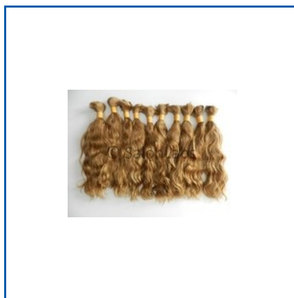
COLORED TEMPLE HAIR