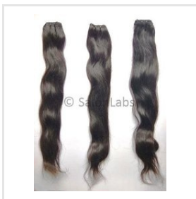
Natural Weft Extensions