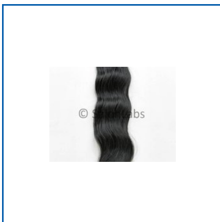
REMY VIRGIN INDIAN HAIR

10 inch Hair Extension, 100% Human Natural Hair Extensions, 100% Real Remy Human Hair Extensions, 100% Virgin Human Hair, 100% virgin remy hair, 12 inch Hair Extension, 12X4 Lace Frontal, 14 inch Hair Extension, 16 inch Hair Extension, 18 inch Hair Extension, 2 Bundle and 1 Closure Hair Deal, 20 inch Hair Extension, 22 inch Hair Extension, 24 inch Hair Extension, 26 inch Hair Extension, etc.