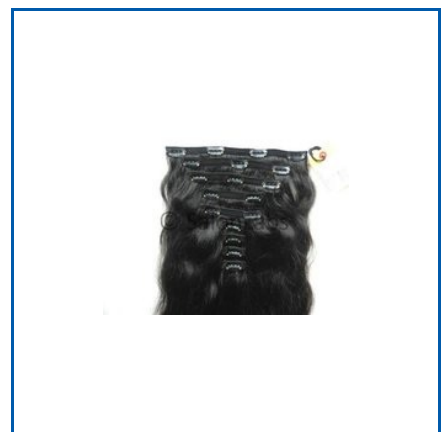
NATURAL HAIR CLIP IN EXTENSIONS