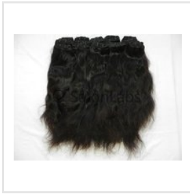
Indian Remy Hair