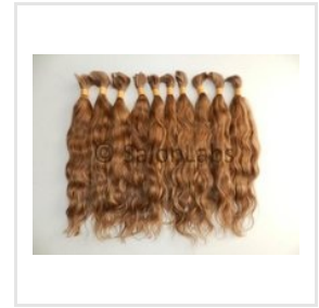
Raw Temple Bulk Hair