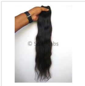
Raw Natural Hair