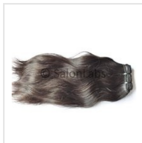
100% Real Remy Human Hair Extensions