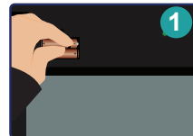
Insert the Batteries.