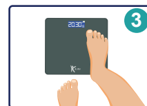
Put scale on a flat surface. Step on the weighing Machine.