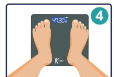
Stay still to see the result.