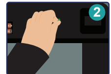
Select the scale unit (Kg /Lb/St).