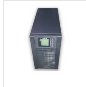
Online Uninterruptible Power Supply