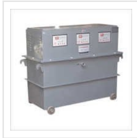
Three Phase Oil Cooled Servo Voltage