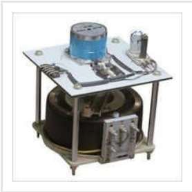
Dimmer Variac Transformer