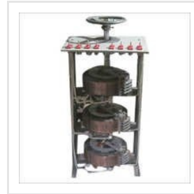
Auto Variable Transformer Variac