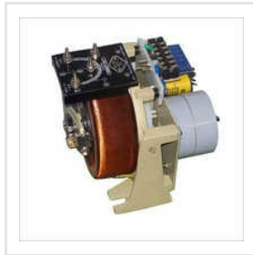
Single Phase Motorized Variac