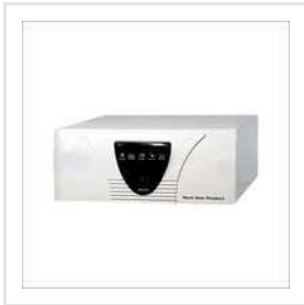
Digital Home UPS