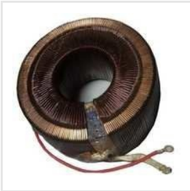
Open Transformer Variac