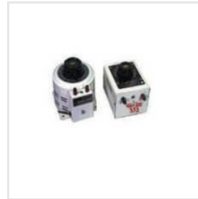
Covered Variac Transformer