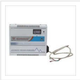
AC Automatic Voltage Stabilizer