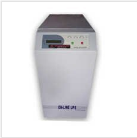
Online UPS With In-Built Isolation