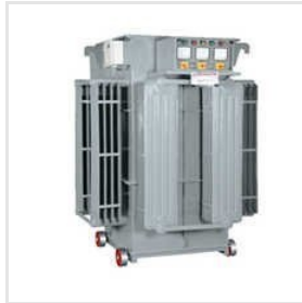
Rolling Contact Type Voltage Controller