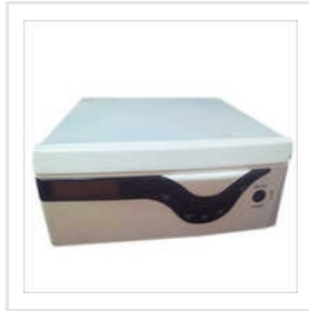
Digital Power Inverter