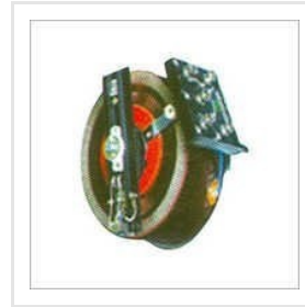
Open Variac Auto Transformer