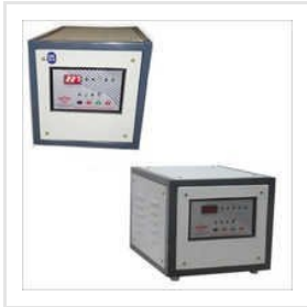
Single Phase Digital Servo Voltage