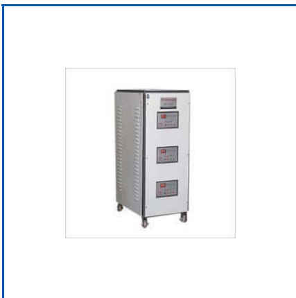
THREE PHASE AIR COOLED DIGITAL SERVO STABILIZER

150 Amp Enclosed Variacs, 230V Automatic Voltage Stabilizer, AC Automatic Voltage Stabilizer, Air Cool Servo Voltage Stabilizer, Auto Variable Transformer Variac, Constant Voltage Transformer (CVT), Covered Variac Transformer, Digital Home UPS, Digital Power Inverter, Dimmer Variac Transformer, Distribution Transformer, Isolation Transformer, Motorised Variac, Oil Cooled Digital Servo Stabilizer, Online UPS with In-built Isolation Transformer, etc.