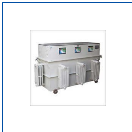
OIL COOLED DIGITAL SERVO STABILIZER