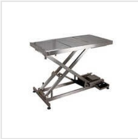
Veterinary Electronic Dental Wet Table