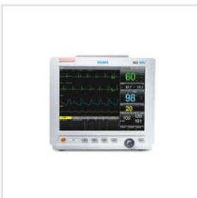
NGMS 90V Veterinary Patient Monitor