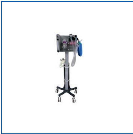
VETERINARY ANESTHESIA MACHINE

25W Mphi Veterinary Laser Therapy Machine, 400W Electro Surgical Generator, Animal IOP Measuring Tonometer, Aquatrek Underwater Treadmill Machine, Careview 1500CW 14x17 Wireless Veterinary Digital Radiography Detector, DE551 Firefly Wireless Veterinary Video Otoscope, DE571 Firefly Wireless Mobile HD Veterinary Video Otoscope, Electric Operating Table With Temperature Control, I-Care Tonovet Plus Calibration Tonometer, Mobile Cart Veterinary Dental Station, Mphi Veterinary Surgery Trolley, NGMS 90V Veterinary Patient Monitor, NGMS-520HD Cmos LED Technology Cystoscope, NGMS-650HD EICK View Video Endoscopes, NGMS-A3CV Veterinary ECG Machine, etc.