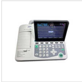
NGMS-A3CV Veterinary ECG