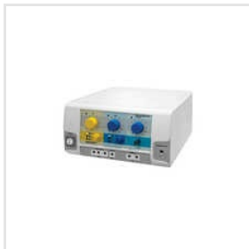
400W Electro Surgical Generator