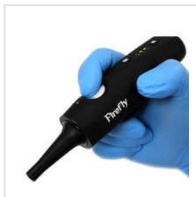
DE571 Firefly Wireless Mobile HD Veterinary