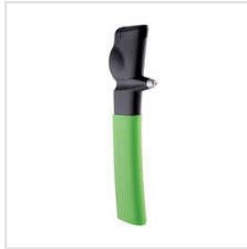
Animal IOP Measuring Tonometer