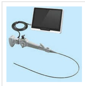
NGMS-520HD Cmos LED Technology