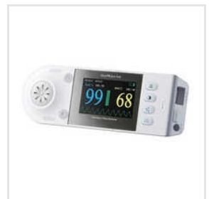
Oxy 9 Wave Veterinary Pulse Oximeter