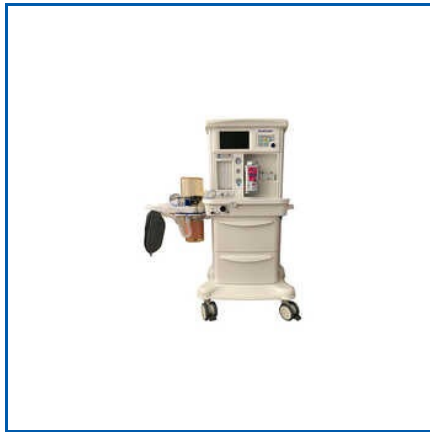
NGMS300V VETERINARY ANESTHESIA WORK STATION