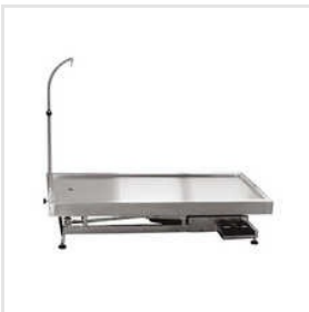
Veterinary Electronic Examination Table