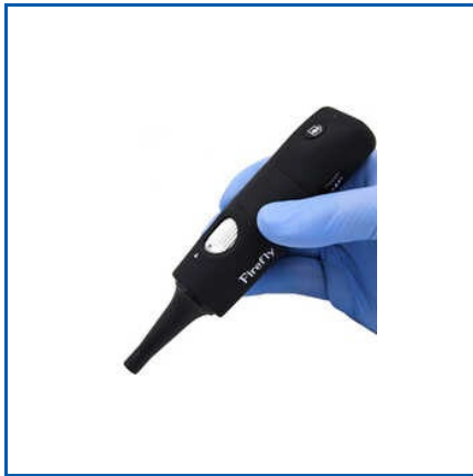
DE551 FIREFLY WIRELESS VETERINARY VIDEO OTOSCOPE