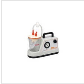
Veterinary Suction Pump