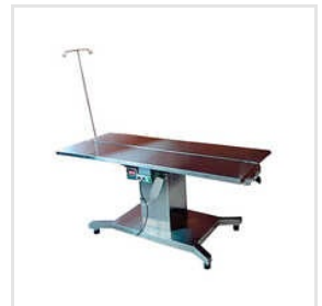
Electric Operating Table With