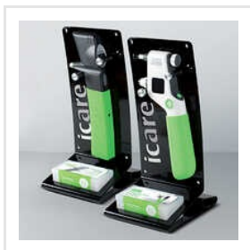
Tonovet Tonometer Stand