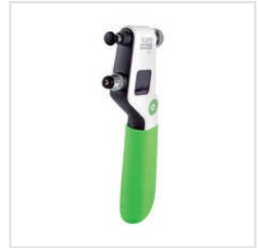
I-Care Tonovet Plus Calibration Tonometer