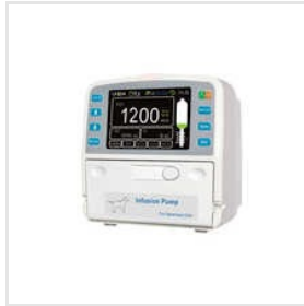
Veterinary Infusion Pump