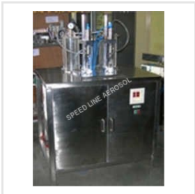
Rotary Filling Machine