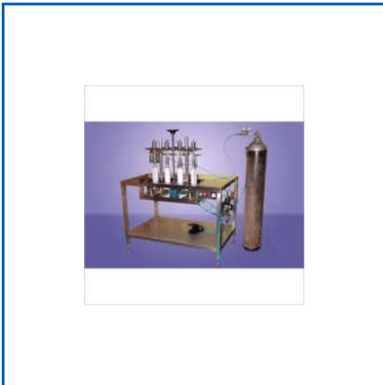
FOUR HEAD SEMI AUTOMATIC CO2 GAS FILLING MACHINE