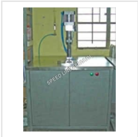
Semi Automatic Crimping Machine