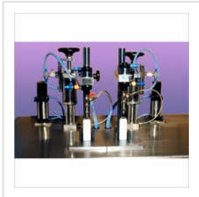
Aerosol Product Filling Machine