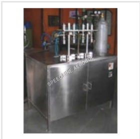
Cosmetic Filling Equipment