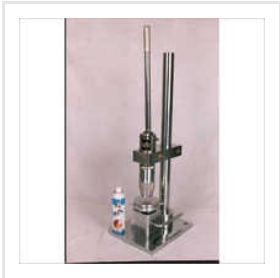
Hand Operated Crimping Machine