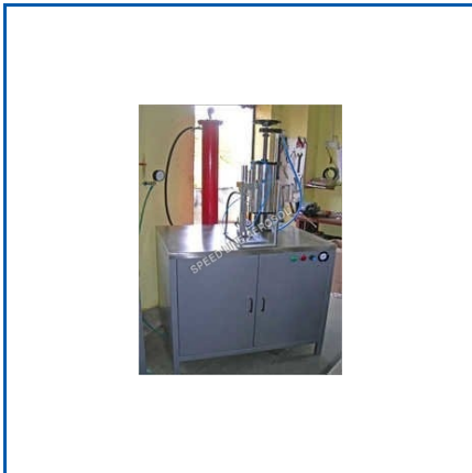
AEROSOL GAS FILLING MACHINE

Aerosol Booster Pumps, Aerosol Can Crimping Machine, Aerosol Can Filling Machine, Aerosol De Crimping Machine, Aerosol Evacuation Pump, Aerosol Filling Equipment, Aerosol Gas Filling Machine, Aerosol Product Filling Machine, Aerosol Tube Cutting Machine, Automatic Gas Can Filling Machine, Automatic Small Can Filling Machine, Bottom Pouring Vacuum Casting Machine, CO2 GAS Filling Machine, Cosmetic Filling Equipment, Crimping Machine (Hand Operated-Bottle), etc.