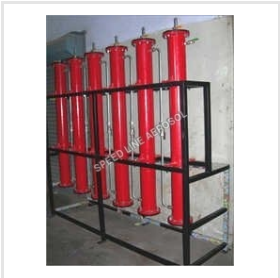
LPG Deodorizing Column