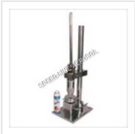
Industrial Aerosol Crimping Machine