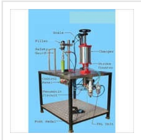
Gas Filling Machine