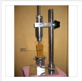
Crimping Machine (Hand Operated-)