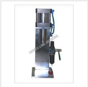
Aerosol De Crimping Machine