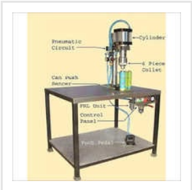
Semi Automatic Crimping Machine