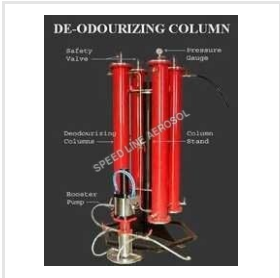
Industrial De Odourizing Columns