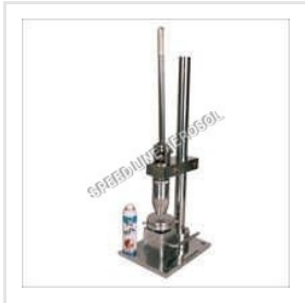
Aerosol Can Crimping Machine