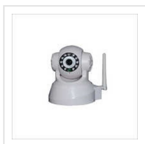
Wireless IP Camera