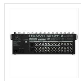
XENYX QX2442USB Audio Mixers