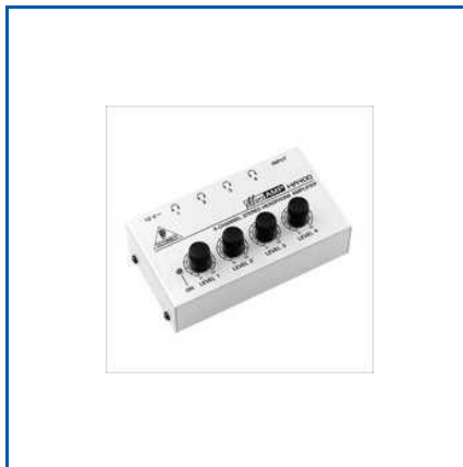
HA400 MICROAMP AMPLIFIERS