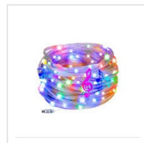
50W Four Blades Fan Bulb