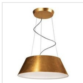
Roomstylers Chilo Light