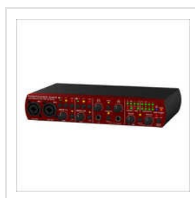
FCA610 Firepower Audio