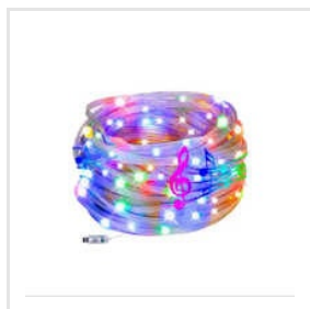
10Mtr Dazzle Flexible Led Fairy Light