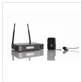
Dynamic Wireless Microphone