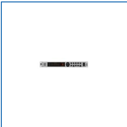
BEHRINGER AUDIO MIXER SYSTEM

10Mtr Dazzle Flexible Led Fairy Light, 180W Two Zone Mixer Amplifier, 18Mtr Tiranga Led Rope Light, 1950-10 Pena Tabletop Microphone, 20W LC1-PC20G6-6-IN Premium Sound Ceiling Speaker, 2x15 w Wh Sq With Glass Rashmi Street Light, 36 W PLL Lamp, 40 W Copper Choke, 40W Oc Copper Choke, 40W Power Tech Led Bulb, 50W Four Blades Fan Bulb, 6.0 sq.mm Building Wire, 65W Spiral CFL Lamp, 6W Lbd0606 Ceiling Speakers, 90w Mixer Amplifier, etc.