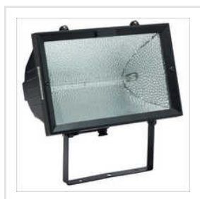
Halogen Flood Light