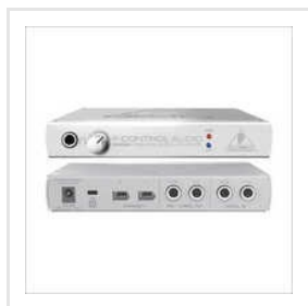
FCA202 F-Control Audio