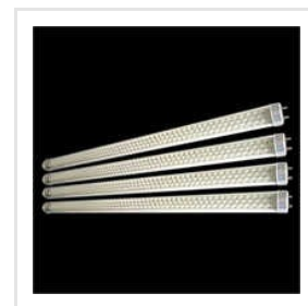
LED Tube Light