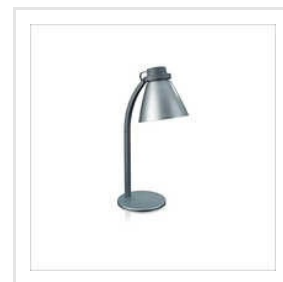
Energy Saving Desk Lamp