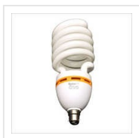
65W Spiral CFL Lamp