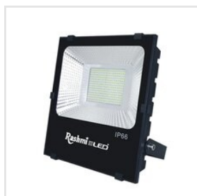
High Beam LED Flood Light