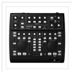
BCD3000 B-Control DeeJay Audio