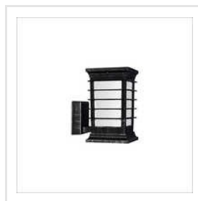
Garden Wall Light