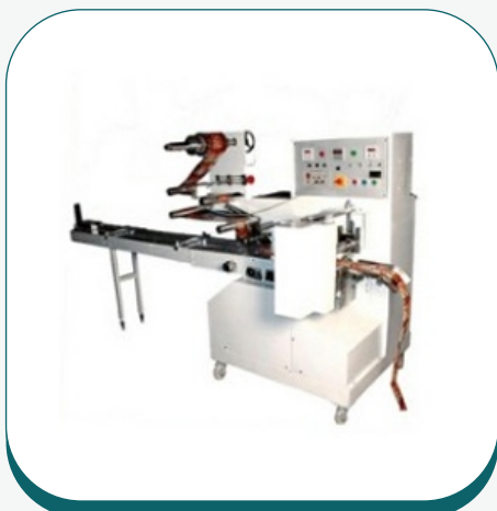
Horizontal Flow Wrapper Packaging Machine