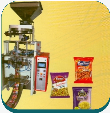
Pneumatic Collar Type Packaging Machine (PLC Based)