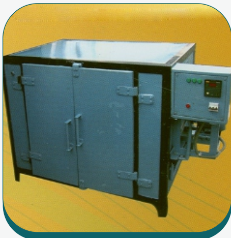
Hot Air Tray Dryer (Oven) Packaging Machine