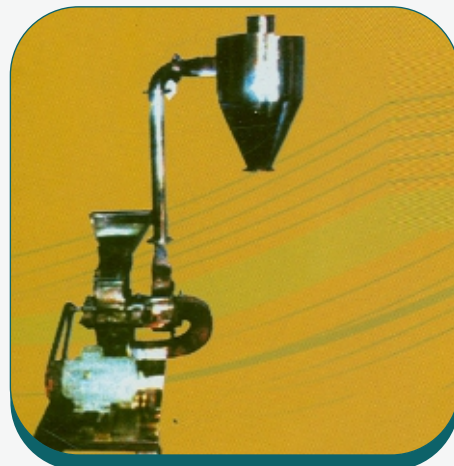
Pulveriser ( Hammer Type) Packing Machine