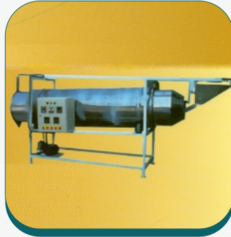
Rotary Roaster Packing Machine