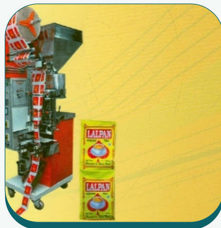
FFS Center Sealing Packaging Machine