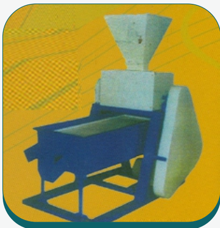
Supari Cutter Packaging Machine