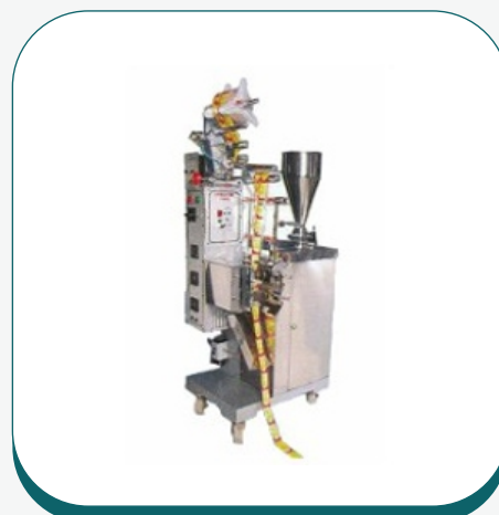
F.F.S Four Side Sealing Packaging Machine