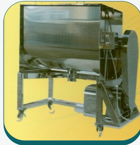
U Type Mixer Packaging Machine