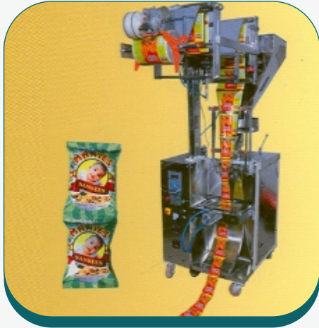
FFS Half Semi Pneumatic Packaging Machine