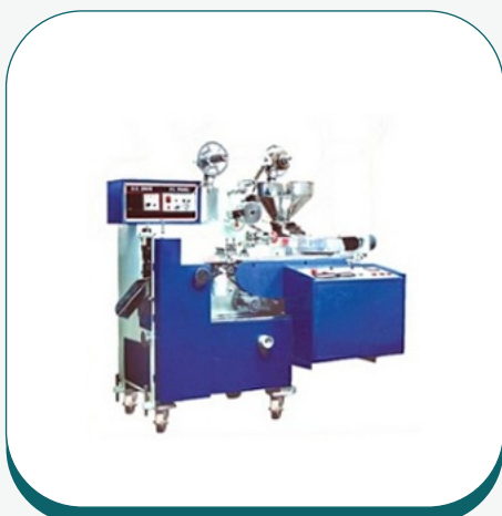
Candy Pillow Packing Machine